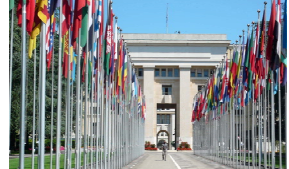
The working group will meet next week at the Palais des Nations in Geneva

The intersessional open-ended intergovernmental working group was charged by the Preparatory Committee to continue work on the document. At its first formal meeting on November 27, 2008, the working group, which is open to the participation of all Member States, agreed that its preliminary stage of work should be a technical review of the proposals and that it should remove duplications, harmonize sections and drastically reduce the text.