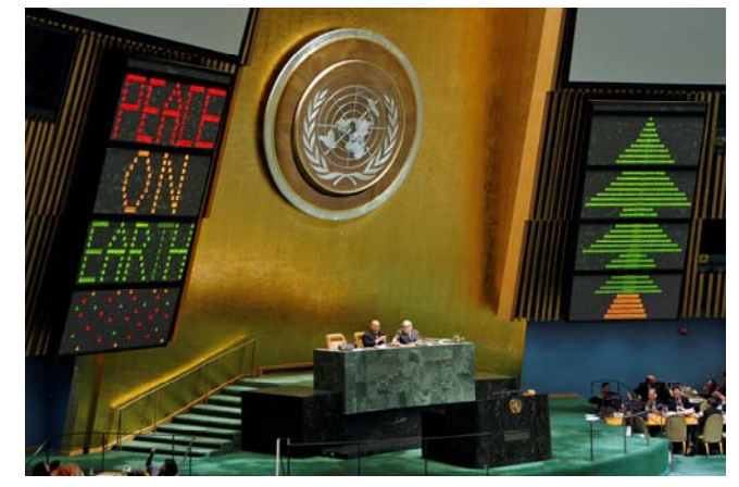
The General Assembly concluding its 63rd session in December 2008

Other Resolutions relating to racism and racial discrimination include, inter alia, Resolutions on: indigenous issues; the