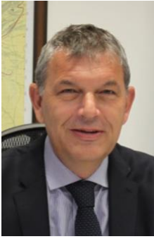
Mr. Philippe Lazzarini Resident Coordinator/ Humanitarian Coordinator/ Deputy

Philippe Lazzarini has 30 years of professional experience including in leadership positions with the United Nations, the private sector and the International Committee of the Red Cross. Since August 2015, he has been in the office of the UN Secretary-General as the Deputy UN Special Coordinator for Lebanon (UNSCOL), UN Resident and Humanitarian Coordinator for Lebanon. He has extensive experience in humanitarian assistance and international coordination in conflict and post-conflict areas at senior levels. Prior to this, he held a number of senior positions in the United Nations Office for the Coordination of Humanitarian Affairs, and in various field positions in Iraq, Angola, Somalia and the Occupied Palestinian Territory. Philippe Lazzarini also joined the Union Bancaire Privée in Geneva where he promoted the corporate social responsibilities and ethical investment agenda of the Bank and served as Head of the Marketing Department. He also worked for 10 years with the International Committee of the Red Cross (ICRC) as the Deputy Head of Communication, Head of the ICRC delegation in Rwanda, Angola, and Sarajevo and as an ICRC delegate in Southern Sudan, Jordan, Gaza, and Beirut.