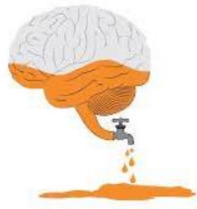
Brain Drain vs. Brain Gain