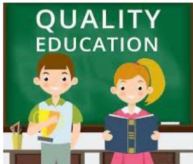
Quality vs. Quantity in Education