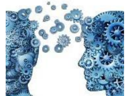
Migration for Education vs. Education for Migration