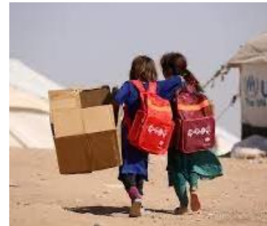
Refugee Children & Education