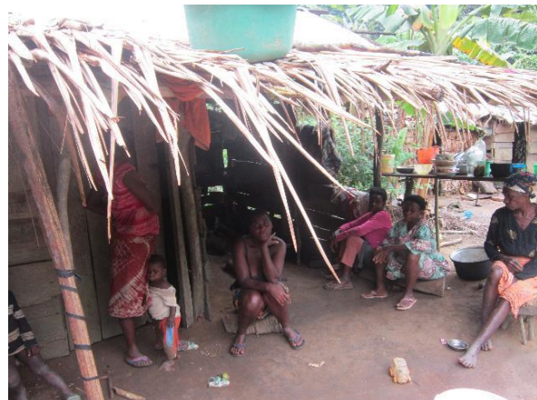
Indigenous Bagyéli forest dwellers in the OP6 CPS target landscape, Lokoundjé, Cameroon

In relation to sustainable energy access for IPs, SGP Bolivia has supported indigenous Chiquitanos from the Bahía Negra Community in the center of the San Matías Integrated Management Natural Area to install photovoltaic (PV) systems to address their rural water and energy needs. Located at the cusp of two fragile interconnected ecosystems (Tropical Dry Forest and Pantanal), water resources in the municipality of San Matías are abundant, where many of the indigenous communities live along the banks of rivers and lagoons. At the same time, many of these IPs paradoxically suffer from a lack of access to a reliable supply of clean drinking water in their homes. In this context, the SGP project distributed 19 photovoltaic (PV) systems to IPs affiliated with the Chiquitana Indigenous Center Dawn Robore (CICHAR): thirteen for domestic lighting purposes; and another six in public spaces (church, educational unit, and four in public spaces located in Santo Corazón). The SGP project contributed to the organization of a 'water management committee' for the operations of the PV system, enabling the drilling and installation of a solar pumping system, installation of water tanks, rehabilitation of a defunct distribution network, and installation of additional faucets. As a result of the SGP project, anthropogenic pressure on the river ecosystem has been reduced, and the IPs now have access to safe drinking water leading to a significant decrease in bacterial and waterborne diseases.