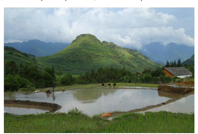
Dao Cham indigenous people of Nam Dam village

In Vietnam, SGP has worked with the Dao Cham indigenous people in Nam Dam village located in the 'Dong Van Karst Plateau' Geo Park. The village, which has 47 households where 235 Dao Cham IPs live, has a long tradition in using medicinal herbs for health care. With the advent of the Nam Dam Community Co-operative, the development of herbal bath services started to garner increasing