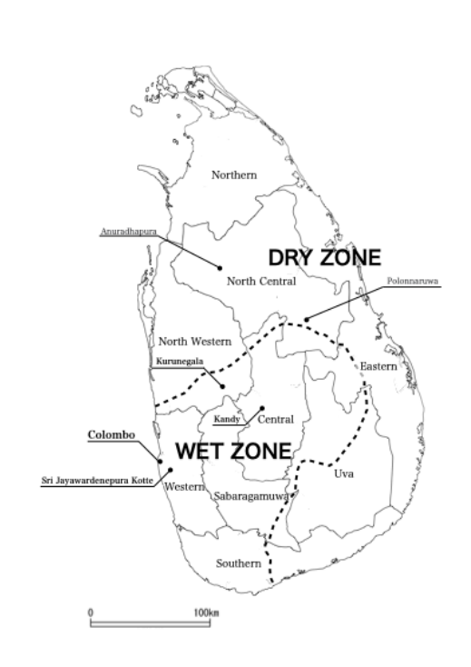
Map1. The land areas of wet and dry zone in Sri Lanka

year. This area contains ancient cities such as Anuradhapura and Polonnaruwa and is of historical importance as a source of civilization and Sinhala Buddhist culture. Although its environment and malaria have been barriers for both settlement and cultivation, the ancient culture and civilization was built on rice production and expanded by extensive and contemporaneously advanced irrigation works (International Bank for Reconstruction and Development 1952).