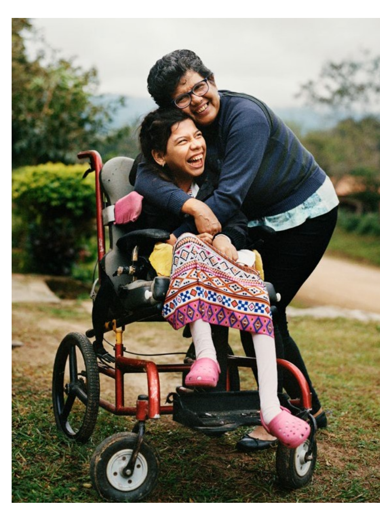
It was taken as part of the European Union project Bridging the Gap II – Inclusive Policies and Services for Equal Rights of Persons with Disabilities and appears courtesy of the International and Ibero-American Foundation for Administration and Public Policies.

(a) Establishing, funding and implementing a programme of independent intermediaries or facilitators trained to provide communication assistance to parties to the proceedings and the justice system to determine whether accommodations and support are necessary and which accommodations and support are appropriate, and to assist with communication throughout the course of the proceedings;