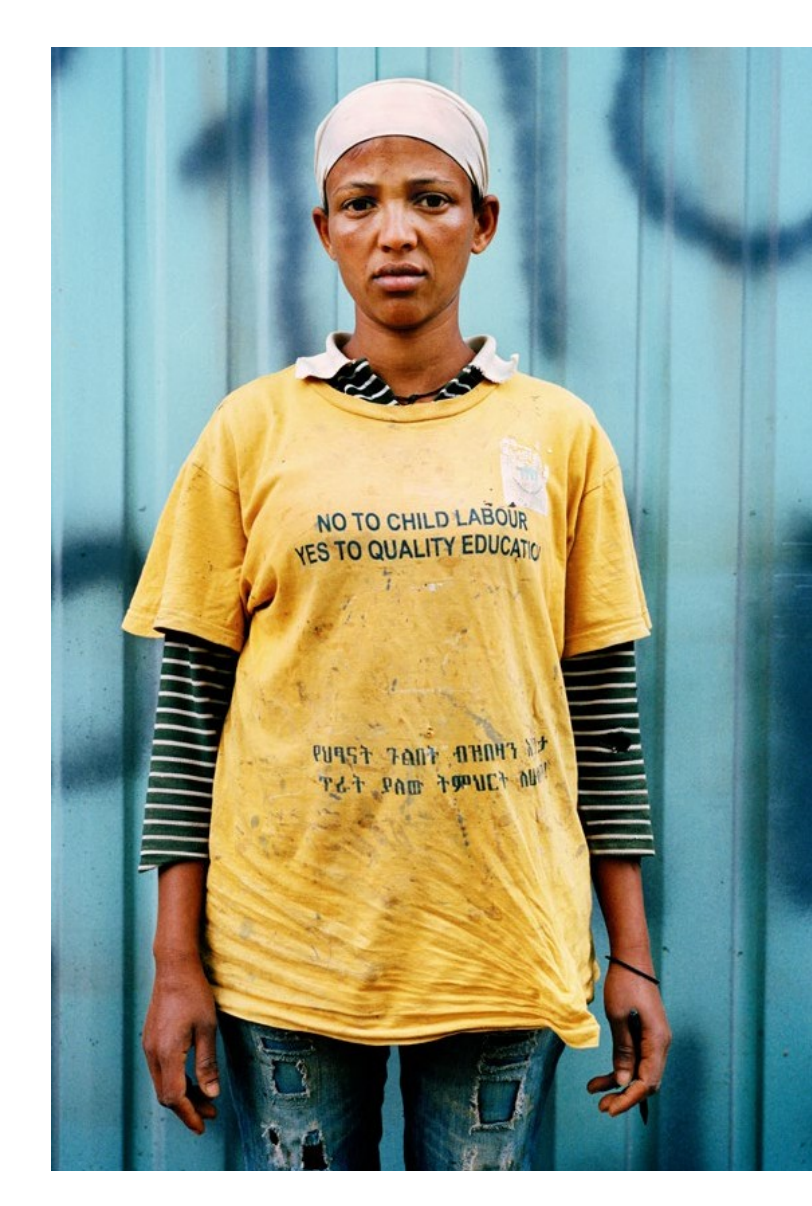
Photo by Christian Tasso. It was taken as part of the European Union project Bridging the Gap II – Inclusive Policies and Services for Equal Rights of Persons with Disabilities and appears courtesy of the International and Ibero-American Foundation for Administration and Public Policies.