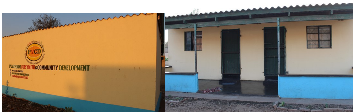
Figure 6 Back and front photos of Vemuganga CRI without identity insignia

For example, Vemuganga Community Radio Station operates under the Forum for Young and Community Development Trust (FYCD). During interviews with CRI Coordinators and Community Advocates, a problem that arose out of this scenario was that visibility of the CRI was severely affected (see photos below).