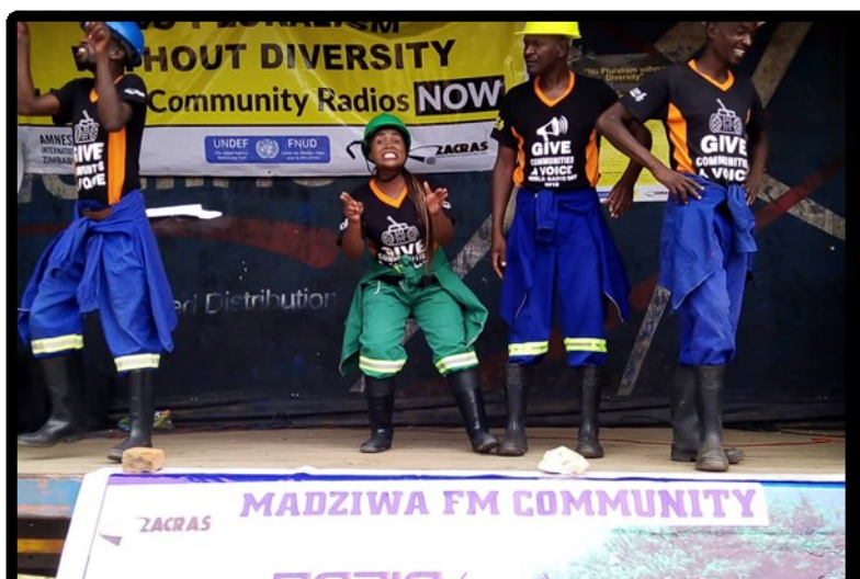
Figure 1 Theater performance advocating of CRIs

The project benefited 10 unlicensed CRIs located in Zimbabwe's 10 provinces as well as the communities surrounding these radio stations. An important strategy employed during