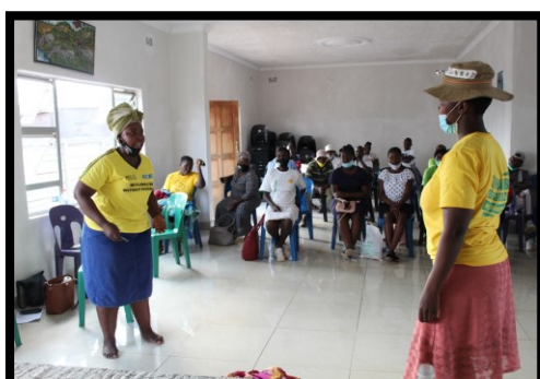
Figure 4: Drama as a tool for message delivery

During field community visits, the evaluator had the opportunity to witness a drama staged by community advocates imitating part of their everyday engagement with communities and the delivery of their messages (see photo below).