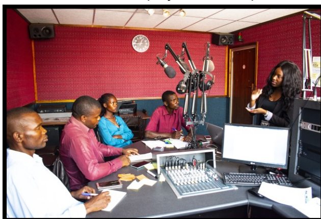
Figure 3 Training of community broadcast content production at Nkabazwe FM, fully equipped with recorders, a computer and editing software.

The UNDEF funded project also helped in building capacity and relevance of CRIs in preparation of getting licensed. For example, at inception, the project held a community radio capacity assessment which assessed, among other things, existing stations' operating space, level of community rootedness and ownership, level of organizational structure, production capacity and use of social media & ICTs, including innovation.