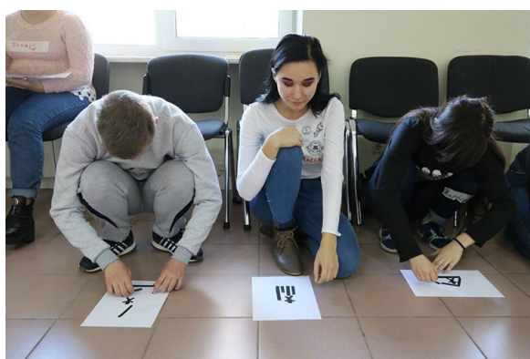
Teenagers are mapping their place in the world

All 18 teenage KIs said that they absolutely loved and felt greatly impacted by the program. All said that their lives had dramatically changed as a result of participating in this program. 17 teenage KIs said that the project gave them tools and knowledge to make changes in their communities and in their lives and gave them strength to approach local authorities, business people, activists, and teachers who could aid in helping teenagers in their civic initiatives. Most importantly, 16 teenage KIs shared that they have now become much more active in their local communities as a result of this project. 9 teenager KIs reported that they were not at all involved in the lives of their local community before this project and that this