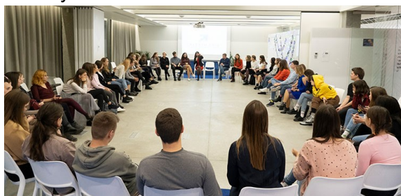
Teenagers are working on presentations of their projects (stage 2)

Survey results showed that 40 (93%) teenage participants completely agreed that this project helped them to learn a great deal about civic engagement, and 36 (83.7%) agreed or strongly agreed that they became more active citizens in their communities as a result of this project. Among adults, 59 (88%) agreed or strongly agreed that this project helped to attract attention to civic education in Ukraine, and 56 (86%) agreed or strongly