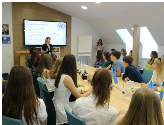
Participants visit the UN office in Kyiv

10 teenage KIs emphasized that they saw value in UNDEF as a sponsor of the project. 1 said, "Through the project I learned more that what place Ukraine has in the world and how problems in the civic community and engagement can be understood by the world." Another pointed out, "Yes, I think this was an advantage. For example, I had to make the World Largest Lesson, which helped me to learn more about UN, and I really like that task." Another UNDEF indication of value added was the fact that, in the eyes of participants, the donor did not have any ties to political leaders of Ukraine. 1 teenage KI specified that the value was in the fact that "I also think I was sure what I can expect from this program because knowing that UNDEF is a donor gave me a sense of authority and I knew I wanted to participate in the program. And I definitely knew that this is a big donor, and the project is not sponsored by