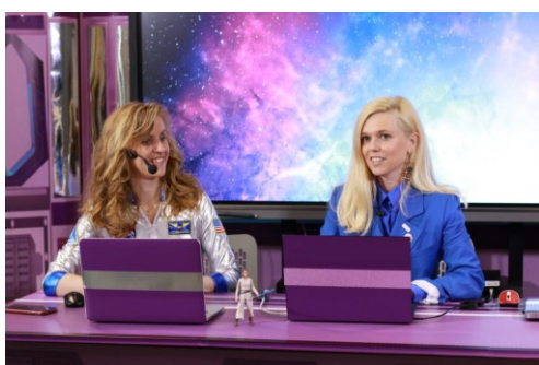
A famous business woman and activist speaks with online participants (final online forum)

Finally, organizers' ability to address issues as they arose in a timely manner and to create a sense of community and belonging among all participants contributed to making this project effective. With the COVID-19 pandemic, the final project event, an all-Ukrainian forum, had to be changed from in-person to online. Despite the initial disappointment of some participants (according to 3 teenage KIs), this change was successfully implemented. As virtual observation of the event and KIs with direct beneficiaries demonstrated, organizers were able to effectively address relevant and important civic education topics. The implementer developed an original, catchy cosmic theme "Shuttle to the Dreams" to guide the online all-day forum, invited high-profile speakers from Ukraine (e.g., a female influencer, business woman, and a community activist) and abroad (e.g., a U.S.-based NASA representative), offered two hands-on practical training workshops with a leading Ukrainian urban space design agency Comixans, and developed many civic-focused contests with prizes (which were later sent by mail to participants).