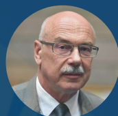
Mr. Vladimir Voronkov Under-Secretary-General United Nations Office of Counter-Terrorism

“As we approach the 20-year anniversary of the attacks of September 11, civil aviation remains an attractive target for terrorist groups. Faced with this reality, it is critical that we do everything in our power to anticipate and counter these threats.” 7 September 2021