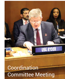
Coordination Committee Meeting

behalf of the Secretary-General, Mr. Guy Ryder, Under-Secretary-General for Policy called for greater efforts to address the conditions conducive to the spread of terrorism and enhanced coordination of UN CT efforts through the Compact to bring the bold vision of the Pact to life. (5-6 Feb)