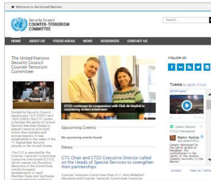
Security Council Counter-Terrorism Committee (CTC/CTED) www.un.org/sc/ctc