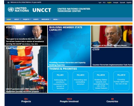
United Nations Counter-Terrorism Centre (UNCCT) www.un.org/uncct