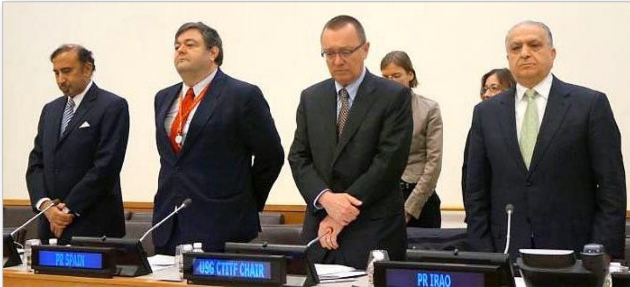
A minute of silence is observed during the conference on Human Rights of Victims of Terrorism

At a Headquarters conference on the human rights of terrorism victims organized by the UN Counter-Terrorism Centre (UNCCT) , on 11 February 2016, the top United Nations political official urged Member States to engage with victims of terrorism and violent extremism, especially the young and the vulnerable, to build on previous commitments and ensure that their human rights are fully respected.