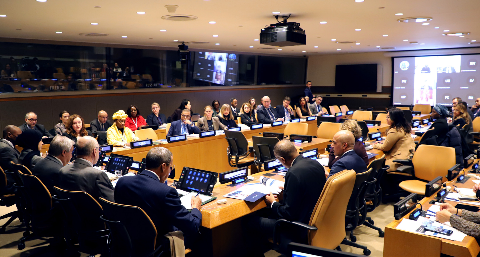
Tenth Meeting of the United Nations Global Counter-Terrorism Coordination Compact Committee (Coordination Committee) on 24 January 2024 in New York.