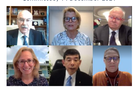
Seventh meeting of Compact Coordination Committee, 14 December 2021

Going forward, Counter-Terrorism Compact entities agreed that collective efforts through the Counter-Terrorism Compact are critical to strengthen the collective situational provide awareness and assistance requesting Member States, notably through enhancing border controls, screening operations, the use of biometrics, and supporting the judiciary. They also called for continued engagement to ensure the rights of women and girls in Afghanistan are respected and the delivery of principled humanitarian assistance. To this end, the Coordination Committee unanimously approved practical steps enhance to regional coordination through the Counter-Terrorism Compact and its impact in the field (Box 3).