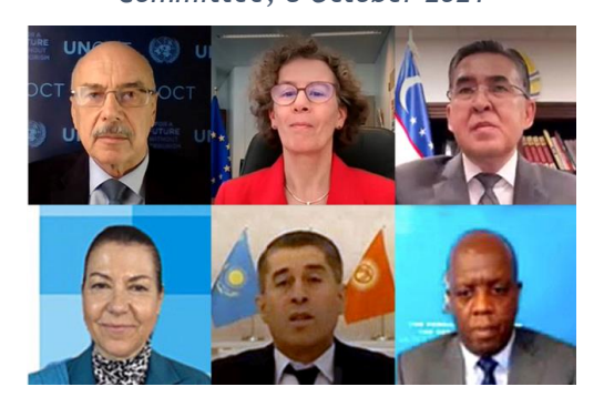
Sixth meeting of the Compact Coordination Committee, 8 October 2021

The December 2021 meeting was convened at the initiative of United Nations Secretary-General António Guterres, who underscored how the terror threat is presently more diverse, spreading offline and online amid growing mistrust, polarization, weak governance, organized crime, and conflict. He encouraged entities to strengthen their efforts