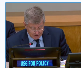
USG FOR POLICY