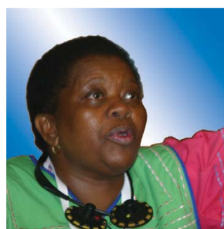
Hon. Ms. Martha Karua, Minister for Water and Irrigation, Kenya

"Empowering women and ensuring their access to water is good for the woman, good for the family, and good for the nation."