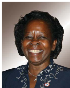
Hon. Ms. Maria Mutagamba, AMIWASH Chair

"AMIWASH will assist African countries to achieve their MDGs through coalition building, WASH advocacy, policy development and implementation. We need to be at the forefront of this initiative that includes a group of women Ministers who serve as WASH champions and raise key issues of gender, the role of women in decision-making, capacity building, and educating children about sanitation and hygiene. I am honored to be part of this illustrious group of leaders and I urge all my Ministerial colleagues to join me in this worthwhile cause."