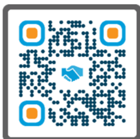
Letter from director, Procurement Division