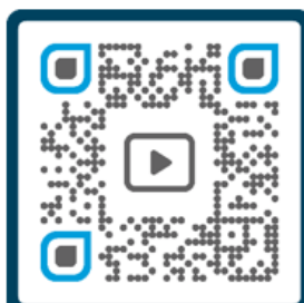
Ariba Introduction Video