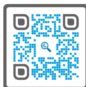
How to manage the contact details in the UNGM account