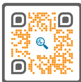
How to access the UNGM account when the person in charge of the account