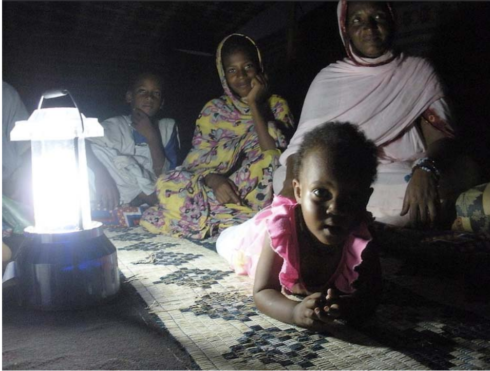
Solar lanterns fabricated by women solar engineers in Mauritania provide clean light at night, eliminating the smoke of kerosene that damages eyes and health of children in particular.