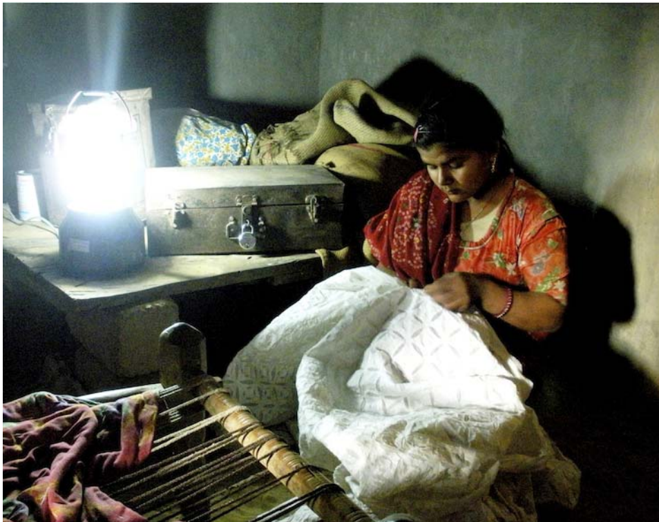
Solar Lanterns provide clean light at night, enabling women to earn additional income through their needlework. The Barefoot College helps women artisans to market their crafts online through www.Tilonia.com .