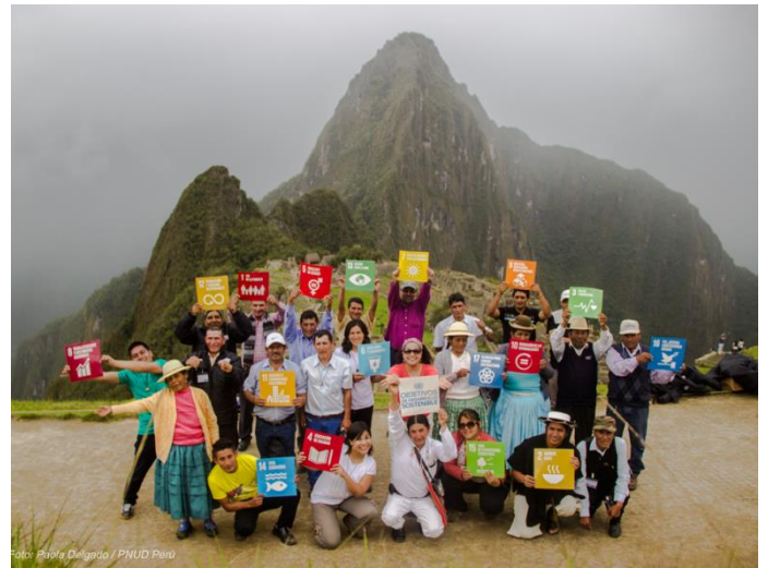
Peruvians with SDG logos in Machu Picchu (Cuzco)

work, presenting the Unpaid Domestic Work Satellite Account.