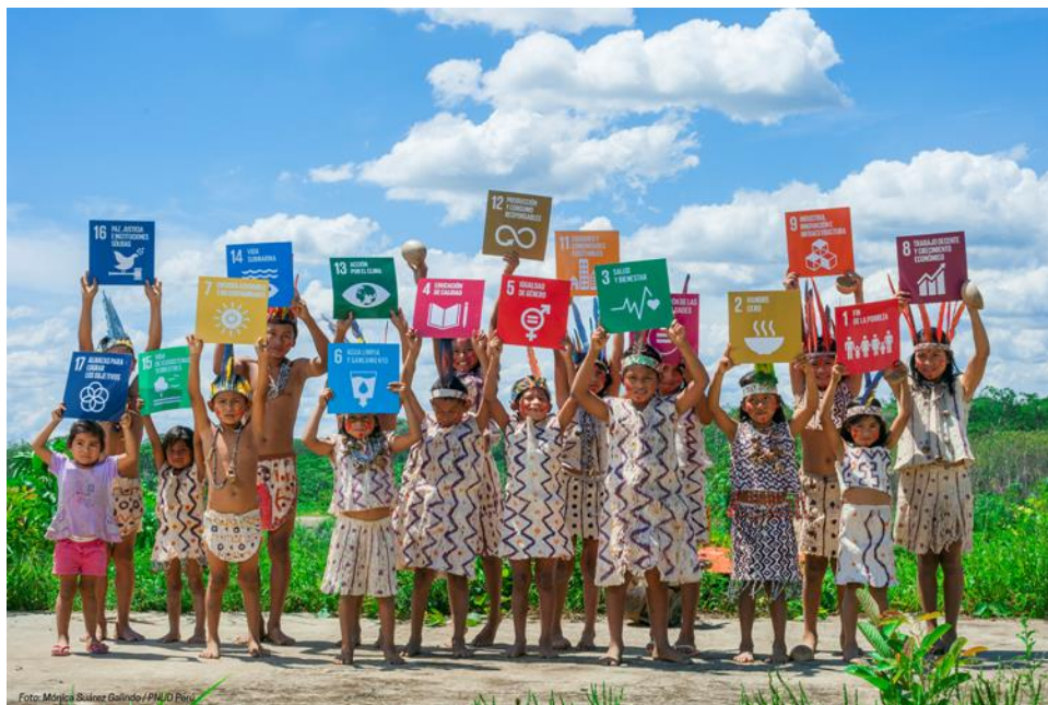
Peruvian children from the Amazon region getting to know the SDGs