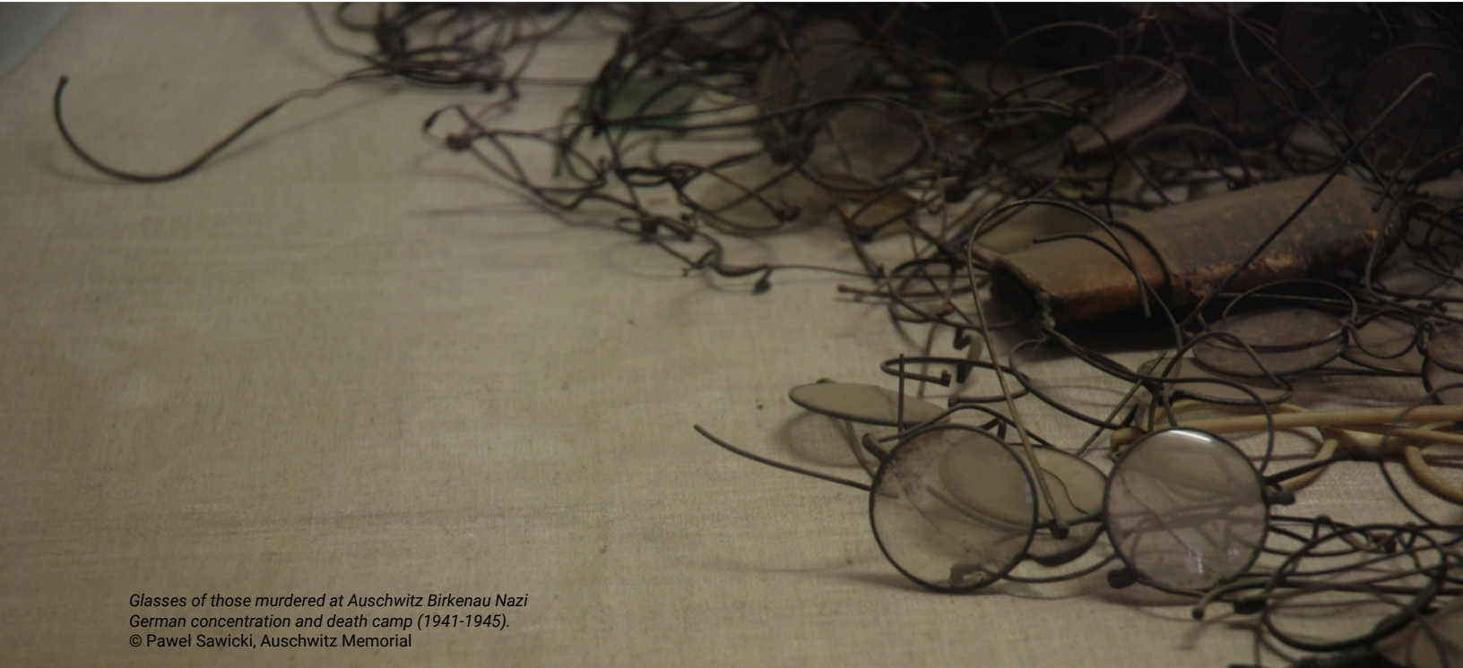
Glasses of those murdered at Auschwitz Birkenau Nazi German concentration and death camp (1941-1945).