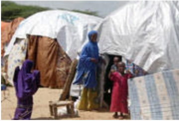
Internal Displaced People (IDPs) in Afgooye, Somalia

12 November - At least 83,000 Somali children and women benefited from the Child Health Days Campaign carried out with United Nations support in the Afgooye corridor, which hosts displaced people who fled their homes owing to the violence in the capital, Mogadishu.