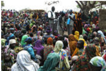
UNHCR workers interviewing people who fled Central African Republic over the border into southern Chad (file)

12 November - The top humanitarian official in Chad called for urgent attention to be paid to providing a better life for young men and women languishing in camps for refugees and displaced persons, warning that the alternatives for them would be prostitution or violence.