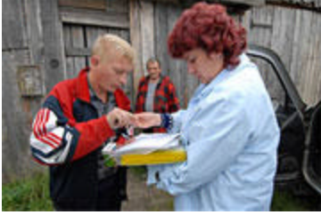
TB patient signs a register after taking his medication

12 November - The United Nations-backed Global Fund today announced that it has approved new grants worth $2.4 billion to projects aimed at fighting AIDS, tuberculosis and malaria in low-income countries over the next two years.