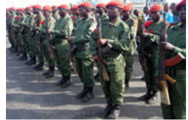
Congolese national army soldiers (file photo)

But at least the country is moving in the right direction, he noted. “There needs to be hope that it can continue to progress, it’s not automatic, it’s not irreversible, but it is progress that needs to be sustained through the leadership of the country itself primarily, and the continuing support of the international community. There’s much to be done but it is heading in the right direction,” he added, stressing that he wanted to give a “slightly more upbeat approach” from his vantage point.