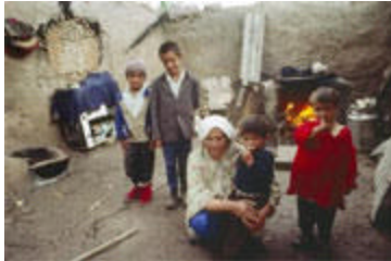
A woman poses with her small children in Kaliab Valley, Tajikistan

12 November - The number of women in Eastern Europe and Central Asia dying from complications in childbirth and pregnancy has been slashed by more than half over the last 10 years, participants at a high-level United Nations gathering in Istanbul heard today.