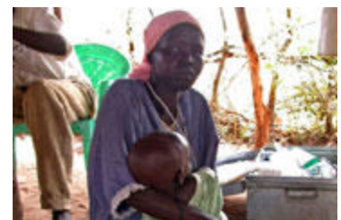
Woman and child at an outpatient therapeutic care centre near Malual Bai, Southern Sudan

She also travelled to Malakal, Akobo and Bor, where she visited therapeutic feeding centres and saw for herself the impact