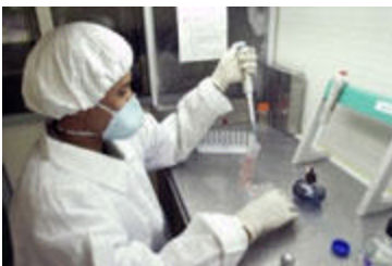
The H1N1 vaccine is being donated to developing nations [File Photo]

10 November - A giant pharmaceutical company is slated to donate 50 million doses of the pandemic H1N1 vaccine to the United Nations public health arm, the World Health Organization (WHO) announced today.