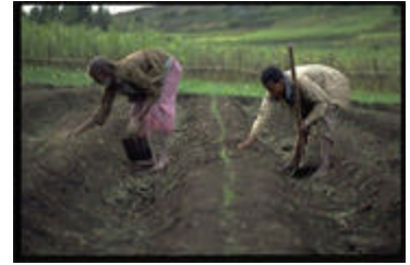
Farming project in Ethiopia

The Supporting Entrepreneurs for Environment and Development (SEED) Award recognizes promising new locally-driven enterprises that work to improve livelihoods, tackle poverty and manage the sustainable development of natural resources in developing countries.