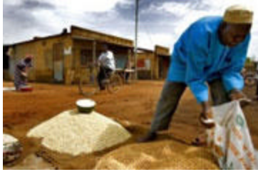
Grain prices in Mali are still far higher than before the food price crisis

10 November - Despite good global cereal harvests this year, millions of people in dozens of poor countries are in desperate need of emergency humanitarian aid due to stubbornly high food prices, the United Nations agricultural agency warned in a report released today.