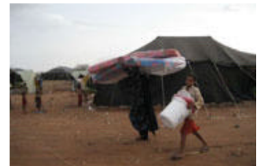
A scene in Al Mazraq camp, Yemen