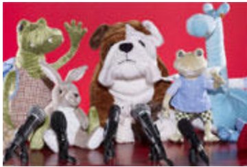
Soft toys from the IKEA campaign to fund UNICEF projects

10 November - More than 500,000 children, mainly in Africa, are expected to benefit from home furnishings and accessories firm IKEA’s Holiday season fundraising campaign, which will donate one euro for every soft toy sold to the UN Children’s Fund (UNICEF) and the non-governmental organization (NGO) Save the Children.