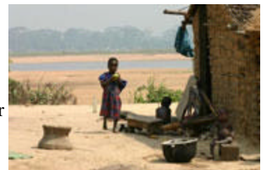
A village on the Republic of Congo side of the Oubangi River, which marks the border with the DRC

Details about the clashes between two tribes in northern DRC that began in early November are emerging now that the UN High Commissioner for Refugees (UNHCR) and Republic of Congo authorities have visited the civilians who fled and are scattered across villages along a 160-kilometre stretch of the Oubangi River that separates the two Congos.