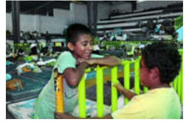
Some of the people in El Salvador who were displaced by Hurricane Ida and moved into 118 government shelters

The office of the UN Children's Fund (UNICEF) in El Salvador has begun providing bottled water, school-in-a-box kits and personal hygiene kits for the affected families, and is requesting support from donor countries to continue helping children as part of the relief effort.