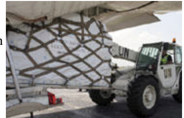
A shipment of electoral logistical support materials for Côte d'Ivoire provided by UNOCI arrives

It is estimated that 680 houses, in addition to a number of public civilian installations, were destroyed in Tskhinvali during