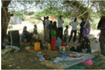
A group IDPS shelter under a tree as floods have rendered thousands living in camps in and around Mogadishu homeless

10 November - Around 16,000 Somalis have been forced from their homes by severe flooding in the south of the strife-torn country, the United Nations humanitarian arm said today, while underscoring that a funding shortfall is hampering relief efforts.