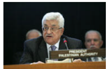
President of the Palestinian National Authority Mahmoud Abbas

Last month, in a message to the Jerusalem International Forum in Rabat, Morocco, Secretary-General Ban Ki-moon said the