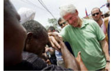
The Secretary-General’s Special Envoy for Haiti, former US President Bill Clinton, meeting with residents of Gonaïves

Mr. Nimetz, who also met with opposition leader George Papandreou while in Athens, said he is keeping in touch with UN Member States that are interested in the name issue, as well as the European Union.