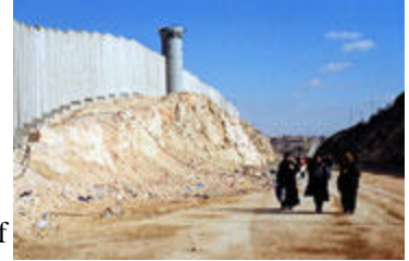
Palestinian women walk near Israel's barrier near Ramallah in the West Bank

Tomorrow marks the five-year anniversary of the Court's Advisory Opinion, in which it called on Israel to halt construction and bring an end to its system of curbing the freedom of movement of Palestinians in the West Bank.