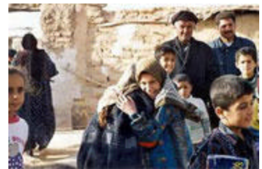
Iranian-Kurdish refugees at the Kawa camp

The 186 Iranian Kurds were moved by UNHCR's Office in Iraq to Al Waleed camp, which already hosts 1,400 Palestinian refugees.