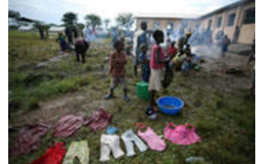
Thousands of civilians have fled violence in eastern DRC

According to Secretary-General Ban Ki-moon's latest report on the DRC, there are some 1.7 million internally displaced persons (IDPs) in the country's volatile east, with 500,000 having been uprooted since this January due to clashes between the FARDC and the rebel Democratic Liberation Forces of Rwanda (FDLR).