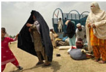
A displaced family arrives in Sugar Mill new camp, in Charsadda district, Pakistan

8 July - Displaced Pakistanis, driven from their homes by fighting between Government forces and militants in north-west of the country, today expressed their desire to return home as soon as possible to the top United Nations relief official.