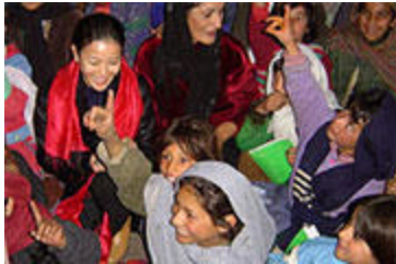
Girls attending the community-based school in the village of Hussain Khel (file photo)

8 July - Violence against women, including rape, is widespread in Afghanistan, according to a new United Nations report, which details the extent of the problem against a backdrop of impunity and a failure by authorities to protect women's rights.