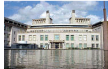
International Criminal Tribunal for the former Yugoslavia (ICTY) building in The Hague

After more than a decade as a fugitive, Mr. Karadžić – who served as the president of Republika Srpska and commander of Bosnian Serb forces during part of the 1990s – was arrested a year ago and transferred to The Hague to stand trial on charges of genocide, complicity in genocide, extermination, murder, wilful killing, persecutions, deportations, inhumane acts and other crimes.