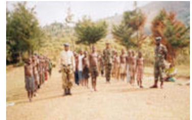
A Central African Republic rebel group has released nearly 200 child soldiers since April 2009