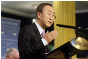
Secretary-General Ban Ki-moon addresses the Institute of International and European Affairs at Dublin Castle, Ireland

7 July - Secretary-General Ban Ki-moon today highlighted a new effort to strengthen United Nations peacekeeping at a time when the demand for the Organization's services is at an all-time high and the global economic crisis threatens to further limit its ability to respond effectively.