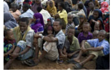
Thousands of Somali refugees, like these, continue to arrive in Kenya