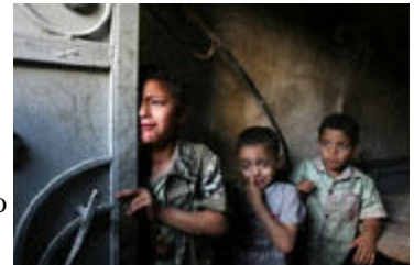
Palestinian children cower in fear during Israeli military offensive in Gaza

"The aim of holding these public hearings...was to show the human side of the suffering, to give a voice to the victims so that they are not lost among statistics," Justice Richard Goldstone, who leads the four-member mission, told journalists.