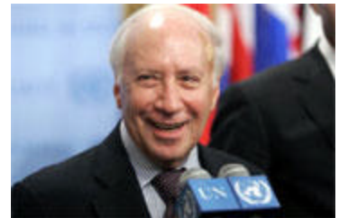
Personal Envoy Matthew Nimetz

Matthew Nimetz, the Secretary-General’s Personal Envoy for the talks, held talks over the past two days in Skopje with senior officials from the former Yugoslav Republic of Macedonia, including Prime Minister Nikola Gruevski, President Gjorge Ivanov and Foreign Minister Antonio Milošoski.