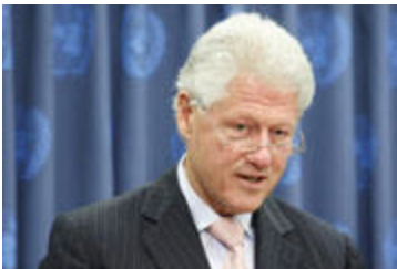
Former United States President and new UN Envoy to Haiti Bill Clinton

7 July - The United Nations Special Envoy to Haiti, the former United States president Bill Clinton, today visited the city of Gonaïves – which was devastated by floods last year – as part of his efforts to boost hurricane preparedness and job creation in the impoverished Caribbean nation.