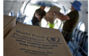
The World Food Programme (WFP) donates High Energy Biscuits

She added that it is a "false logic" for the world to say that it will either invest in tomorrow's agriculture or today's urgent food needs. "There is no question that we must do both," she stated.