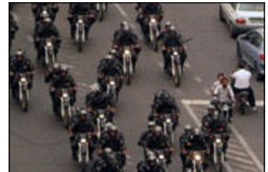
Iranian police on motorbikes patrol a street in Tehran

The experts issued a joint statement calling on the Iranian Government to uphold its international obligations to ensure that all citizens' human rights are protected and to allow independent scrutiny of the current situation.