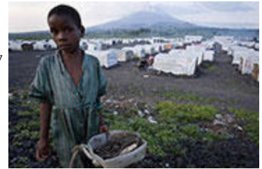
Conflict, chronic poverty and high food prices threaten children’s well-being in the eastern DRC

The Council called on the Governments in the region, especially the DRC and Rwanda, “to continue to build on the positive momentum created by their recent improved relations and to continue to take measures aimed at building confidence