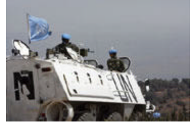
UNIFIL troops at work observing Section 83 near the Blue Line on the border between Lebanon and Israel

The Secretary-General also pledges to continue his diplomatic efforts aimed at resolving the issue of the Shab'a Farms area, and encouraged Israel and Syria to submit their responses to the provisional definition of the area that he had provided.