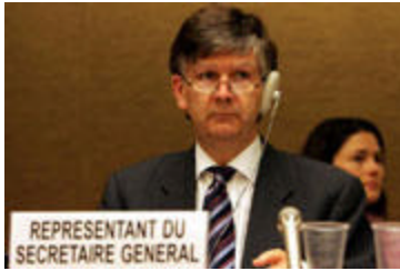
Walter Kälin, the Secretary-General's Representative for the Human Rights of IDPs

7 July - More than one decade after the Balkan wars concluded, Kosovars uprooted by fighting then continue to face serious challenges in returning home and local integration, a United Nations human rights expert said today.