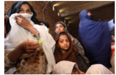
Internally displaced Pakistani women and girls queue for UNHCR relief items

“While it is not the largest crisis in the world, needs in Pakistan are the most immediate of any crisis in the world. The upcoming monsoon season makes meeting those needs an even more urgent priority,” said Under-Secretary-General for Humanitarian Affairs John Holmes.