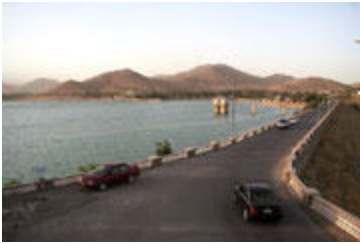
Qargha Lake in Kabul, Afghanistan

7 July - The inefficient management of Afghanistan’s water resources is critical to both the country’s widespread poverty and deadly tribal conflicts over territory, a United Nations envoy said today, calling for better management to help foster stability and build prosperity.