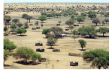
Landscape of Darfur