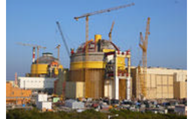
Pressurized Water Reactors (PWRs) under construction at a nuclear power plant

In May Mr. Ban told the Conference on Disarmament that he was encouraged by recent remarks by the leaders of both Russia and the US, and he urged the broader international community to undertake a new multilateral approach to ensure sustainable progress towards disarmament.