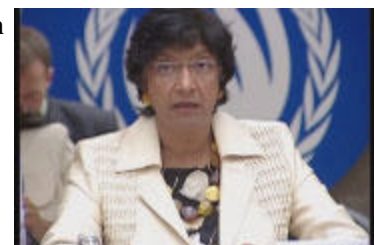
UN High Commissioner for Human Rights Navi Pillay

She also underscored the need to maintain the right of demonstrators to exercise their freedom of expression peacefully.