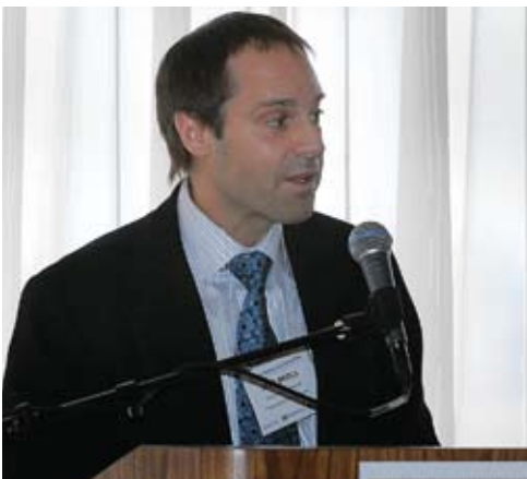
Jeff Skoll, Skoll Foundation & Participant Productions