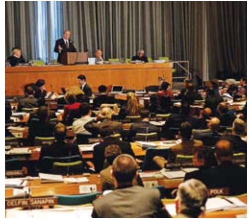
The Summit plenary sessions took place in the Trusteeship Council Chamber of the UN

The Summit was hosted and organized by the United Nations Foundation, the United Nations Fund for International Partnerships, and Ceres, which directs the Investor Network on Climate Risk (see Appendix D for more information about INCR).