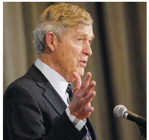
Summit Co-Host Timothy Wirth, President, United Nations Foundation