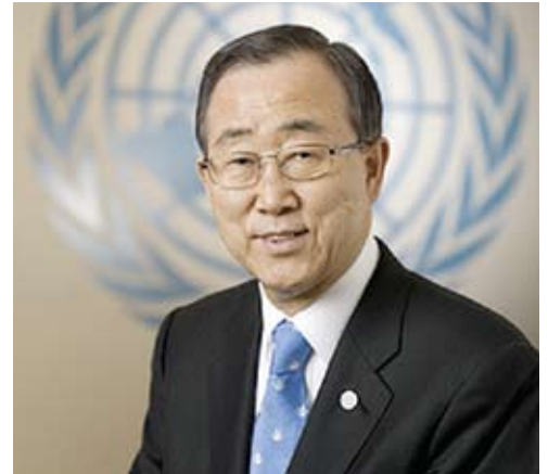
United Nations Secretary General Ban Ki-moon

Wirth asserted that “one of the things that we hope will ultimately be accomplished coming out of sessions like this is to bring the political leadership along and get them comfortable with the need for transformational change ... and get them to understand that climate should not be viewed as ‘woe is me’, ‘this is a terrible burden on all of society,’ - but in fact as the Secretary General said, it becomes a great opportunity for all of the world to develop a job base, a transformed economy, and a very significant new direction.” He reminded Summit participants that they have “a very large leadership responsibility” and that “we are all part of this global issue and the global solution.”