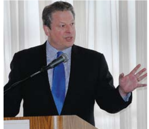
Al Gore, 2007 Nobel Peace Prize winner; Former Vice President of the United States; Chairman, Generation Investment Management

Gore emphasized that this generation ought to see this challenge as “a great privilege” and “confront it with joy in our hearts” because few generations have ever had responsibility for decisions that will affect all future generations. “The fact that that challenge falls to us should cause us to feel like we have the great joy of doing work in our lives that is worth our best efforts. And you are in a position to direct the flows of capital that will make that happen.”