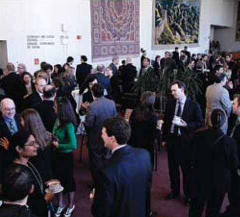
Summit participants networking in the UN Delegates Lounge

More than 450 investor, financial and corporate leaders from around the world gathered at the United Nations Headquarters in New York City on February 14, 2008 for the third Investor Summit on Climate Risk. Participants engaged in dialogue with leading scientists, investors, business leaders, and others on how investors can minimize climate risk and seize opportunities of the transition to a low-carbon economy.