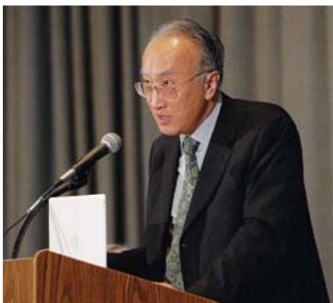
Nobuo Tanaka, International Energy Agency

Companies that are asking these questions now are going to have a much richer understanding of the long-term risks and opportunities and will be substantially ahead of the game. If the investment community begins to recognize and reward this kind of thinking, it could go a long way in driving innovation, helping the industry and the country turn the corner on the challenges posed by climate change, and creating significant value and growth opportunities.