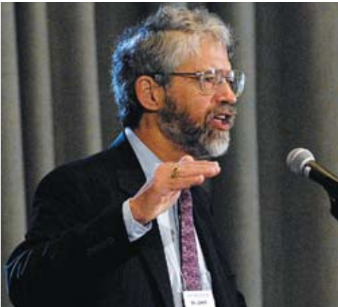
Dr. John Holdren, Harvard University & Woods Hole Research Center