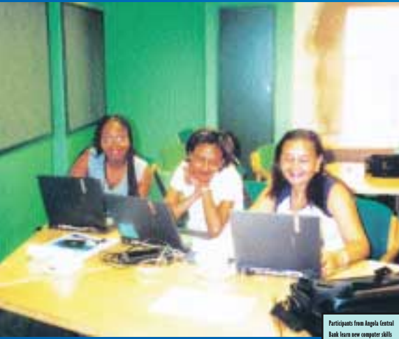
Participants from Angola Central Bank learn new computer skills