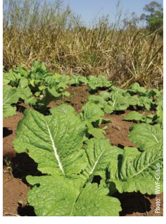
The rehabilitation of the wetlands has restored the condition of these wetlands providing more water for food garden cultivation, increasing community food security.

A cost-benefit analysis (Note b) of the Bush-