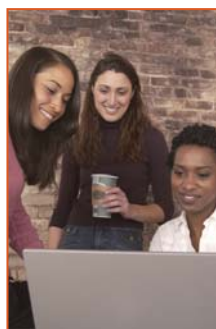
Communities of Interest