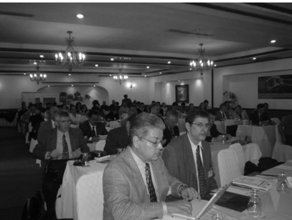
III Regional Forum Biomass, Guatemala, 2004

Energy and Environment Partnership with Central America