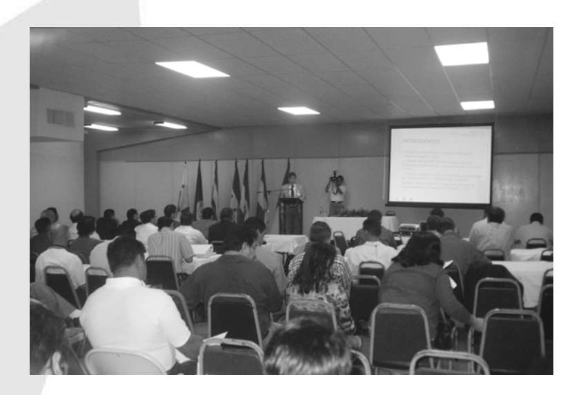
V Forum Smal hydro power plants (EXPO-ENERGIA), Honduras, 2005