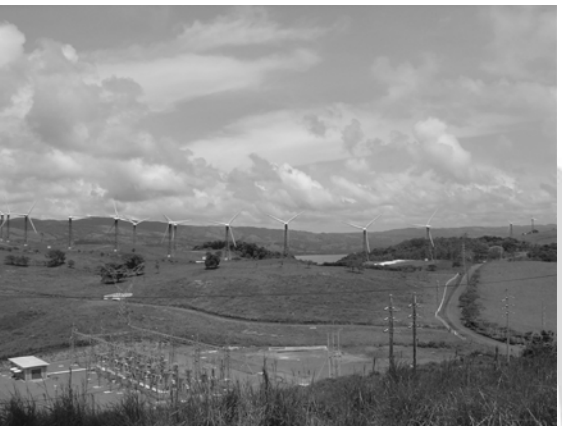
IV Forum, Wind energy, Costa Rica, 2004

II Regional Forum, Financing, Belize, 2003