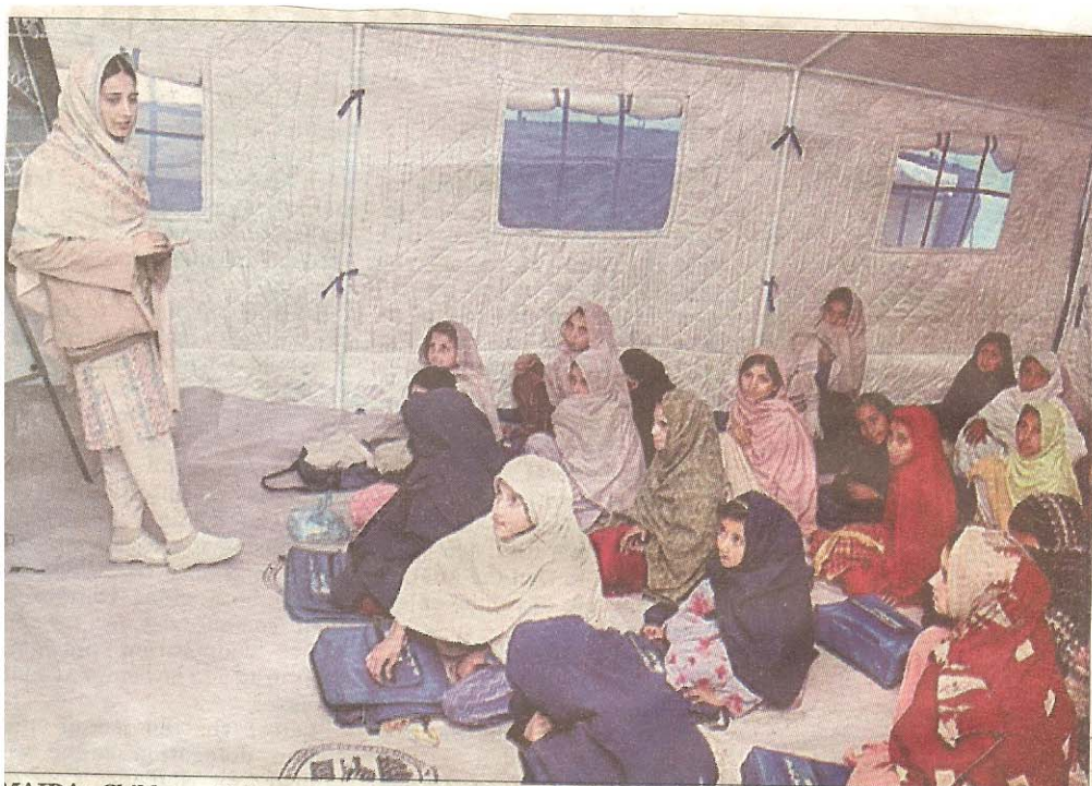
MAIRA: Children sit in a classroom of a make-shift school in the Maira tent camp in Batgram district.