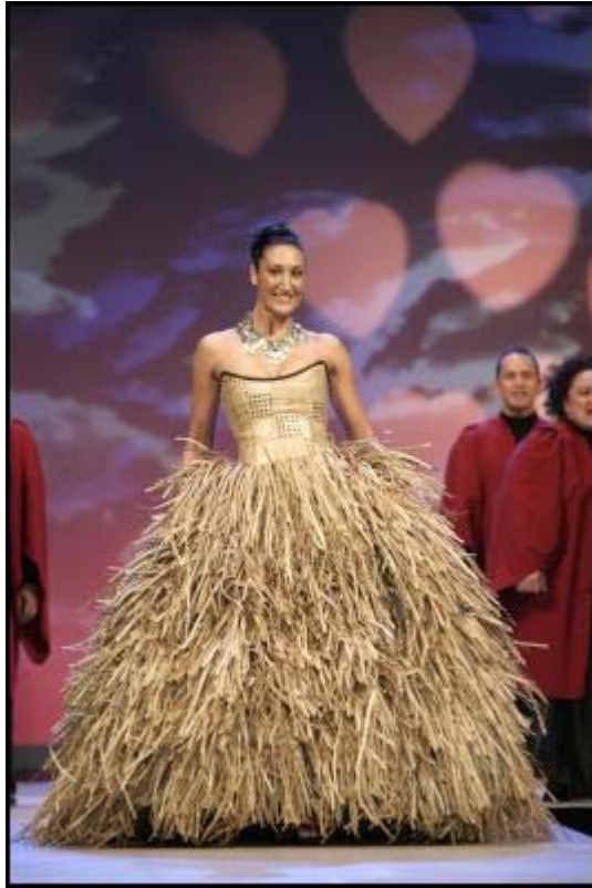
Style Pasifika 2005 4

knowledge concepts and values and these are now being reflected in contemporary medium, for example, hip hop and rap music, fashion design, fusion of Polynesian languages and designs. While the younger generation are innovating traditions –for the most part their reliance on traditional knowledge and practices as the springboard for their innovation is passionate and uncompromising.