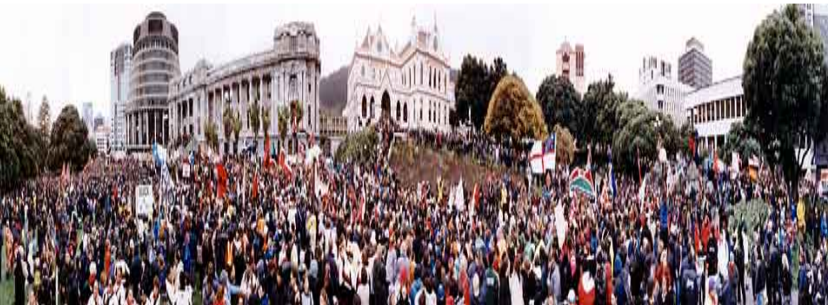
Photo: HIKOI – 50,000 Maori protest about the contemporary confiscation of the Foreshore & Seabed, Parliament, March 2004

Traditional knowledge defines who we are, what makes us unique, what breathes integrity into our existence and relationship with our natural and cultural landscapes.