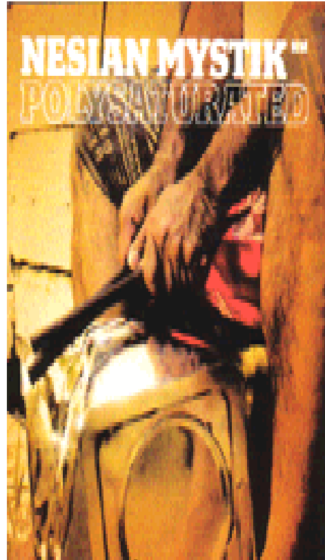
Nesian Mystik 5