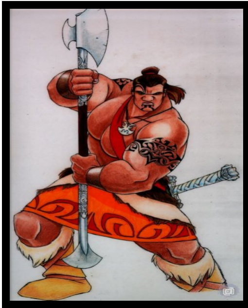
The Mark of Kri, Sony PlayStation

This disparity between global interest and national racial tolerance highlights the major policy problem facing Maori culture. An ad hoc approach to Maori cultural and intellectual property issues that manifests as a lack of respect for Maori cultural integrity and aspirations.