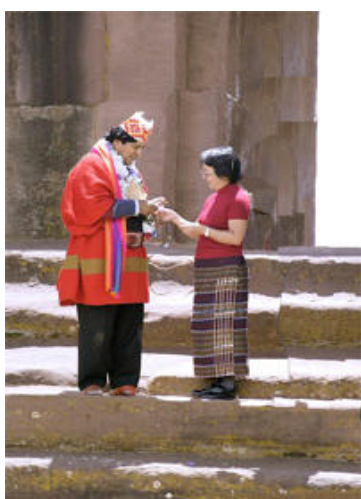
H. E. Mr. Evo Morales, Presidente de Bolivia and Ms. Tauli-Corpuz, Chairperson of the Permanent Forum, January 2006

Release of the Film "Indigenous Peoples and the United Nations"