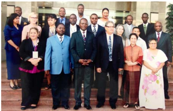
Permanent Forum members, Government officials of the Republic of Congo and Secretariat staff in Brazzaville (Republic of Congo).

In preparation for its twelfth session (20 – 31 May 2013), the Permanent Forum Members and its Secretariat met in Brazzaville, Republic of Congo, from 11 to 15 March 2013. Hosted by the Government of the Republic of Congo and opened with a statement from the President, H.E. Mr. Denis Sassou Nguesso, delivered by the State Minister of Transport and Civil Aviation, the meeting provided an opportunity for Permanent Forum Members to meet with