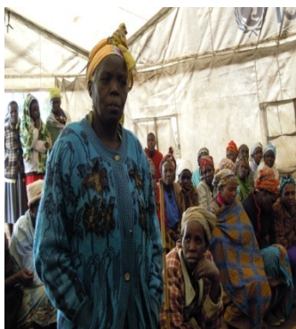
Ogiek Woman leader at Mt. Elgon

This is both at the individual and community levels and includes institutional strengthening for organizations working with hunter gatherer communities. Leadership training would be the starting point to build proactivity, vision and a sense of purpose.