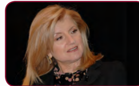
Arianna Huffington President and editor-in-chief, AOL Huffington Post Media Group

On the other hand, however, political representatives cannot and should not implement policies without sufficient concertation and consultation. Data is “big” and instantaneous but decision- and policy-making still require time and reflection . Surely governments must find ways to embrace the immediacy of digital interaction but they also need time to shape the right public policies.