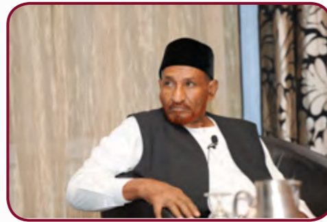
Sadig Al Mahdi, Prime Minister of Sudan (1966-1967, 1986-1989) and Member of the Club de Madrid

Twenty-first-century institutions are neither bigger nor smaller. Instead, networked institutions work differently. They accelerate the rate of interaction within and between institutions with new ideas and information. They are smarter hybrids – an amalgam of bounded organization and fluid, dynamic network – that leverage somewhat anarchic technologies within tightly controlled bureaucracies to connect professionals and data within the institution to people with good ideas and information outside of it in order to solve problems democratically. As Dr. Martin Luther King, Jr. said: “Now is the time to make real the promises of democracy.”