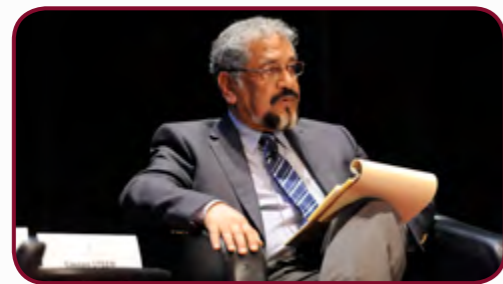
Cassam Uteem President of the Republic of Mauritius (1992-1997, 1997- 2002) and Member of the Club de Madrid