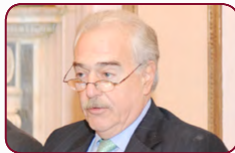
Andrés Pastrana President of Colombia, 1998-2002 and Member of the Club de Madrid

Technology can in some cases be a threat to civil liberties ; something that Club de Madrid Member Andrés Pastrana (President of Colombia, 1998-2002) illustrated very well with his anecdote on the “Assange vs. Zuckerberg dilemma”. He quipped, one gives private corporate information to the public and is declared an enemy; the other give private personal information to corporations and is the man of the year.