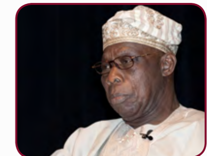
Olusegun Obasanjo President of Nigeria (1976-1979, 1999-2007) and Member of the Club de Madrid