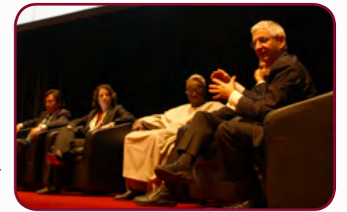
Irving Wladawsky-Berger, Strategic Advisor, IBM and Citigroup, MIT and Imperial College

The major challenge, however, for the majority of the people is to actually understand what and where the problems actually lie. This is particularly the case for government agencies. Opening up the floodgates of data and communication threatens to drown unprepared bureaucrats and politicians who might get lost in what Irving Wladawsky-Berger called the “ cacophony of voices ”.