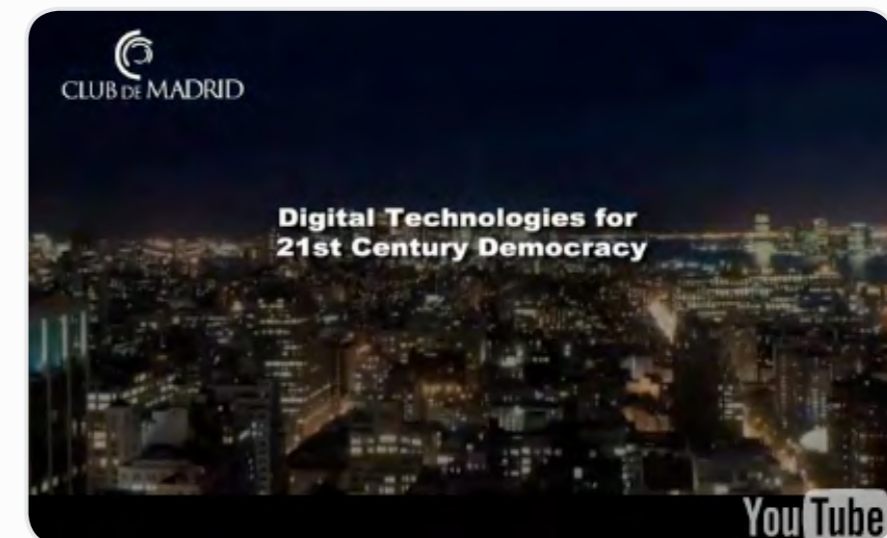
Dr. Judith Rodin President of the Rockefeller Foundation (watch video of her speech at http://www.clubmadrid.org/2011conference )

Click here to watch a video summary of the X Annual Conference Club de Madrid Digital Technologies for 21 st Century Democracy http://www.clubmadrid.org/2011conference