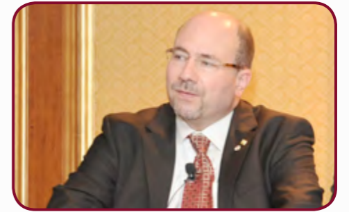
Craig Newmark Craigslist.org

In turn, citizens must also assume their share of the responsibility and take advantage of the data and the networks to effectively address collective problems. One way to do so is by creating incentives for interoperability or resort to mechanisms of emulation for innovation as Todd Park did when revolutionizing the US Department for Health and Human Services.