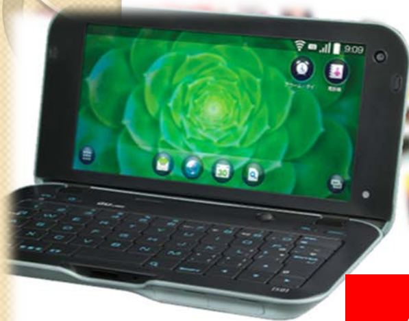
IS01 by SHARP