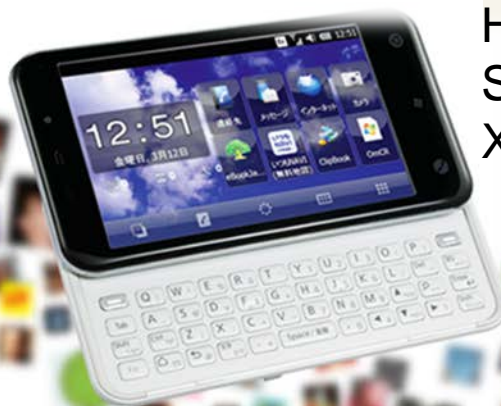
IS02 by TOSHIBA