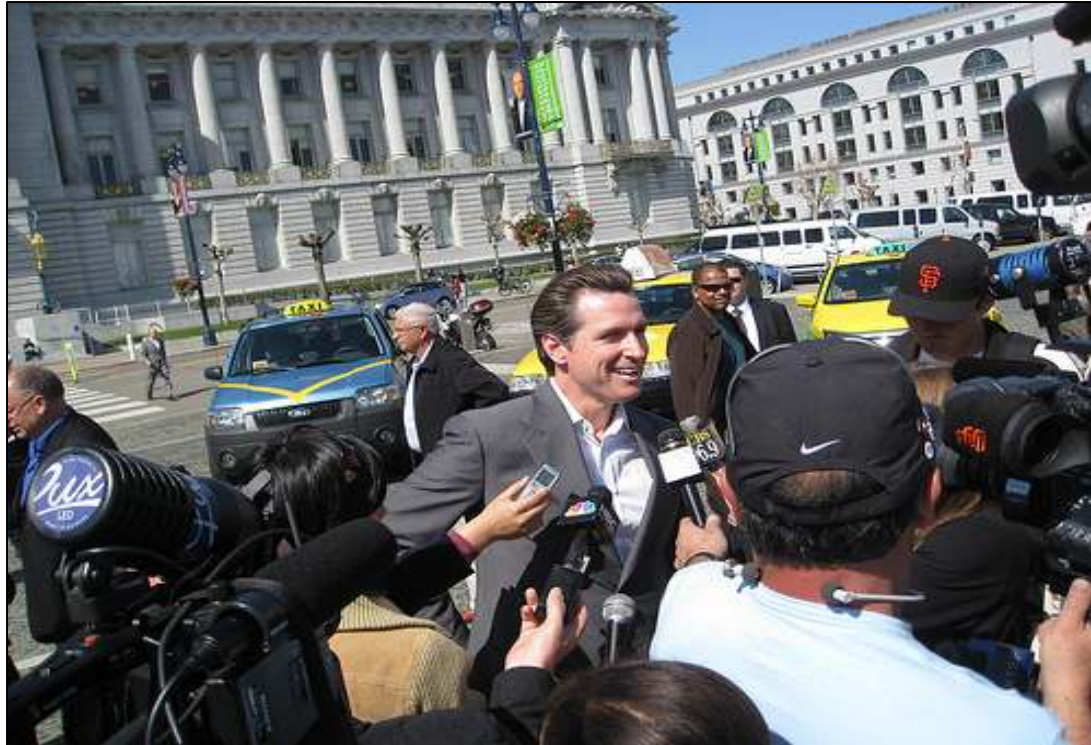
Mayor Gavin Newsom announces to reporters that the taxi fleet is 57% green in March 2010.

In 2008 the City of San Francisco set goals for reducing greenhouse gas emissions. The city let the taxi industry decide how to meet the goals by 2012.