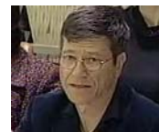
Jeffrey Sachs, Special Adviser to the Secretary-General on the MDGs, addressing the Economic and Social Council on corporate

http://www.un.org/ecosoc/phlntrpy/philanthropy.shtml