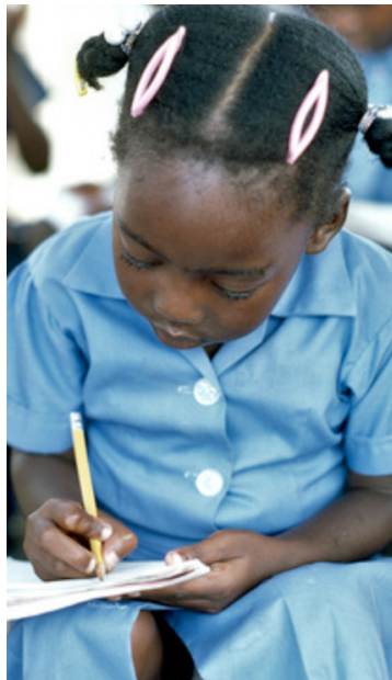
Child at an outdoor class runs by the local community for the children of squatters in Vere, Jamaica.