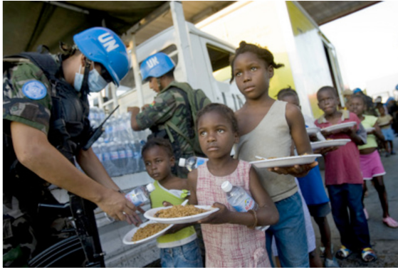
United Nations peacekeepers distribute water and meals to the residents of Cité Soleil, Haiti.