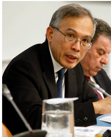
ECOSOC President opens 2010 High-level Segment

Under the overall theme of the 2010 Annual Ministerial Review (AMR), "Implementing the internationally agreed goals and commit-