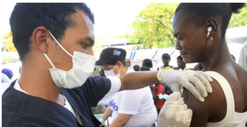
Doctor administers vaccinations at camp for displaced Haitians

the Ministerial Declaration on global public health adopted by the Council in 2009. The discussions benefited from a high level participation, including of three UN Executive Heads and a Deputy Executive Head, as well as a number of high-level personalities, such as the Heads of global alliances in the health sector and major private sector representatives as well as the participation of the Personal Representative of the Prime Minister of the host country for the recently held G-8 and G-20 Summits. The discussions have constituted an important link towards the High-level plenary meeting of the General Assembly on the MDGs, and allowed for a review of major trends in the global health sector, including on international aid commitments.