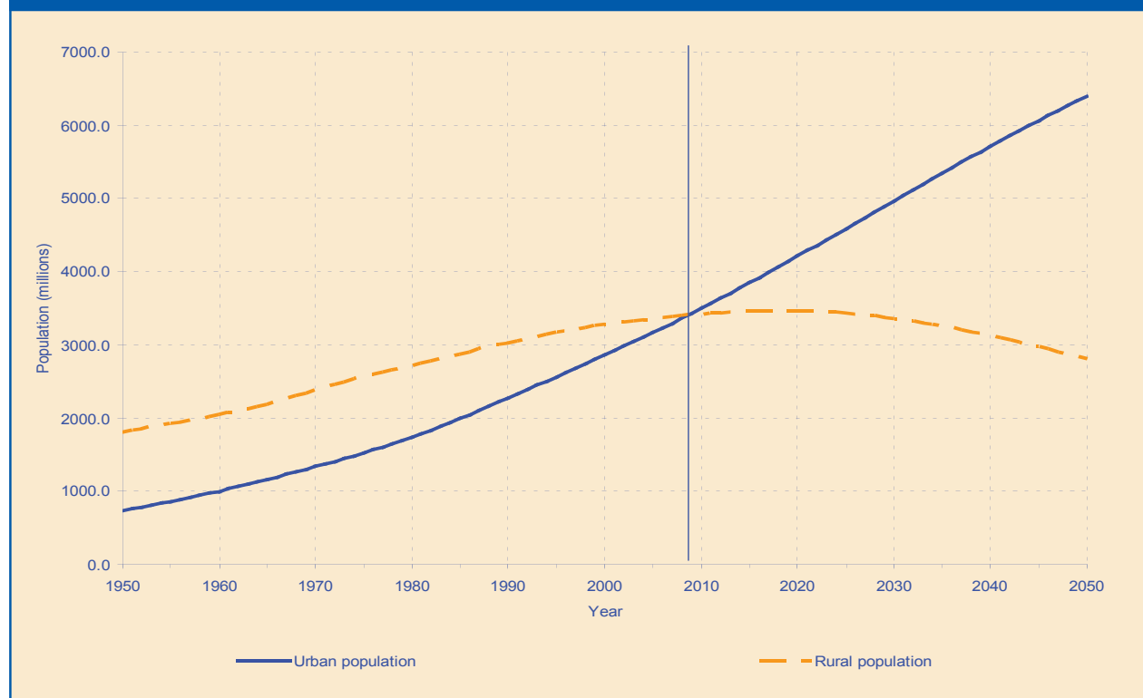
Figure 2. Urban and rural population of the world, 1950-2050

Despite its low level of urbanization, in 2007, Asia was home to about half of the urban population in the world. Europe had the second highest share, at 16 per cent. Over the next four decades, Africa and Asia will experience marked increases in their urban populations. The urban population of Asia is projected to more than double and that of Africa will likely triple. By mid-century, most of the urban population of the world will be concentrated in Asia (54 per cent) and Africa (19 per cent).