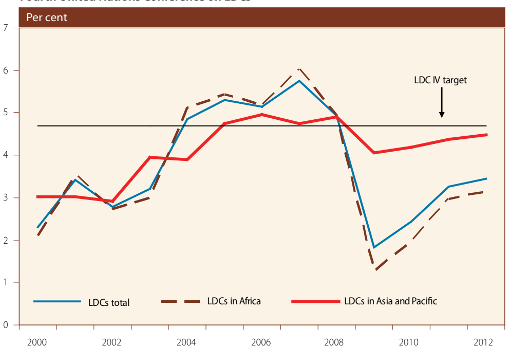
Figure 3 Diverging per capita income growth among LDCs,<sup>a</sup> but falling short of target of the Fourth United Nations Conference on LDCs<sup>b</sup>

Istanbul in May 2011,¹ while per capita income growth in African LDCs is projected to fall well short of this target in the outlook for 2011 and 2012 (figure 3).