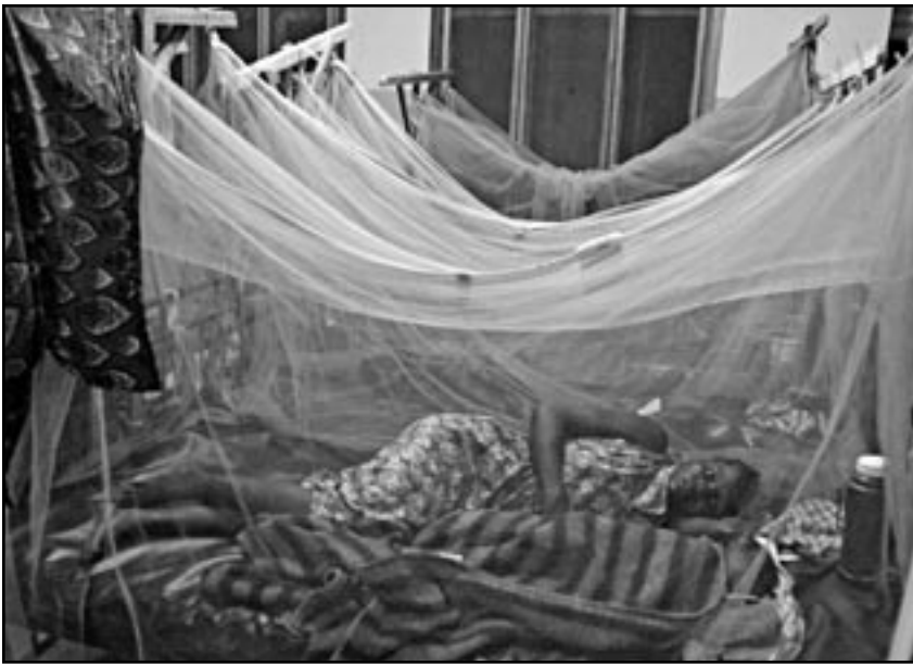
By protecting against malaria, insecticide-treated bed nets can reduce African child mortality by one fifth.

simply too poor to provide all basic necessities for children to survive and develop, UNICEF stresses. Governments therefore must devote a bigger share of their budgets towards meeting children's needs.