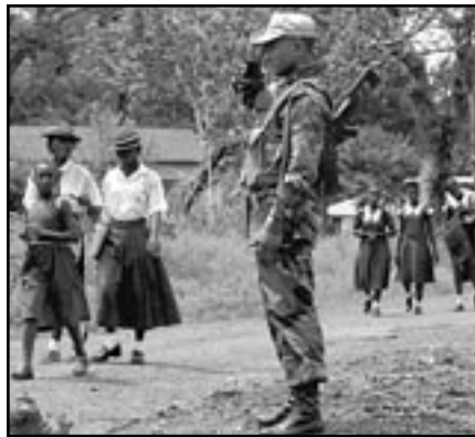
Peacekeepers helped Sierra Leone get its children back to school.

When UNAMSIL started operations in 1999, its prospects appeared uncertain. A tentative peace agreement was in place between the government and rebel factions, designed to end a civil war that began eight years earlier, but the rebels resumed armed actions in 2000. UNAMSIL soon helped