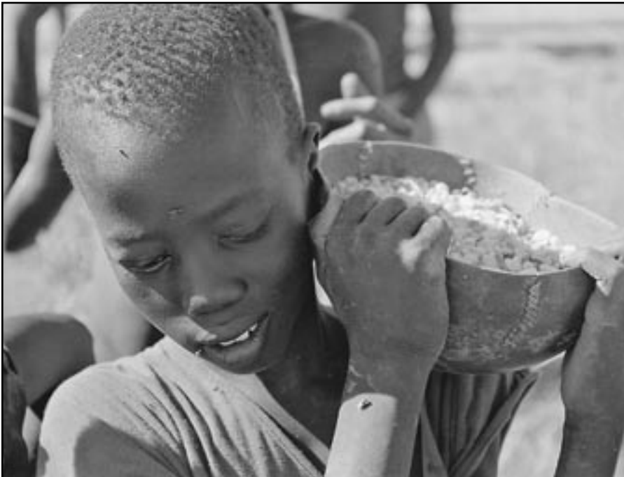
UN / Eskinder Debebe

International food relief often arrives too late — after the hungry have begun to die in large numbers.