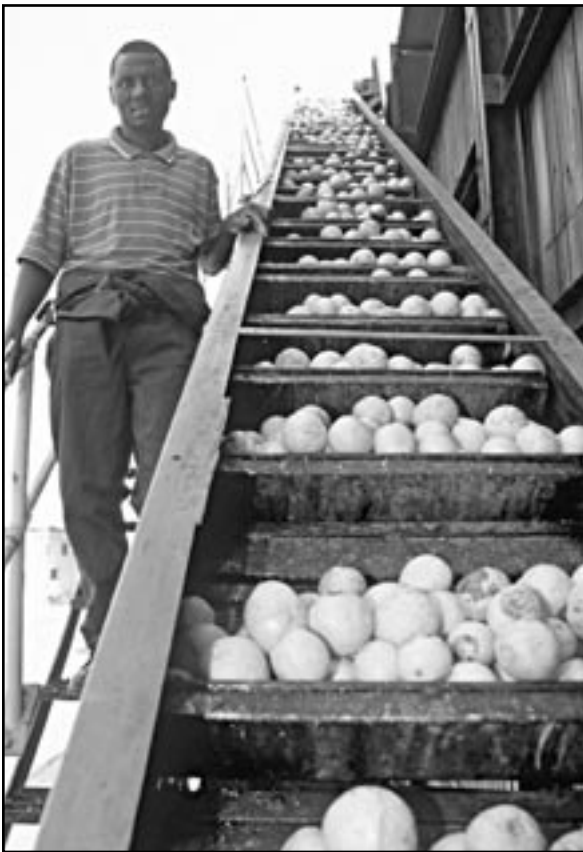
Citrus in Zimbabwe: African agricultural exports often face excessively strict health standards to enter Northern markets.

While there is a clear need for SPS measures to protect consumers, the benefits of trade liberalization in the agricultural sector achieved by the Uruguay