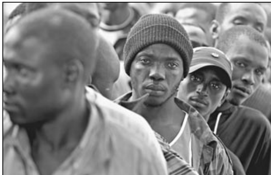
Africans held by Spanish immigration authorities: Northern countries are increasingly concerned by growing flows of undocumented migrants.

A better response, he suggests, is to start by recognizing that migration can be positive for those who move, for the societies they move to and for the societies they leave behind. ■