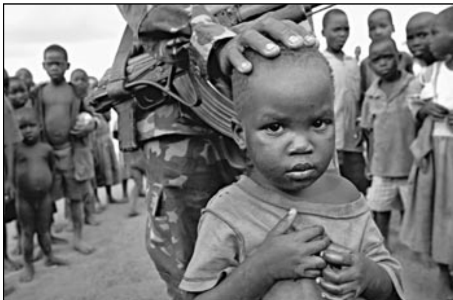
A Ugandan soldier with displaced children. More than 1.6 million villagers have fled the terror-stricken northern countryside.

The indictments were originally drafted in June. But Ugandan mediators