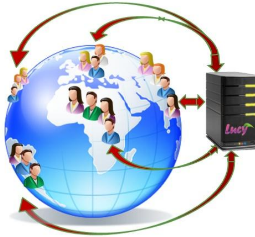
Fig. 1: LUCY®

LUCY concept is a new Digital Inclusion platform which utilizes Next Generation Technologies and Services, consisting of the following main components: