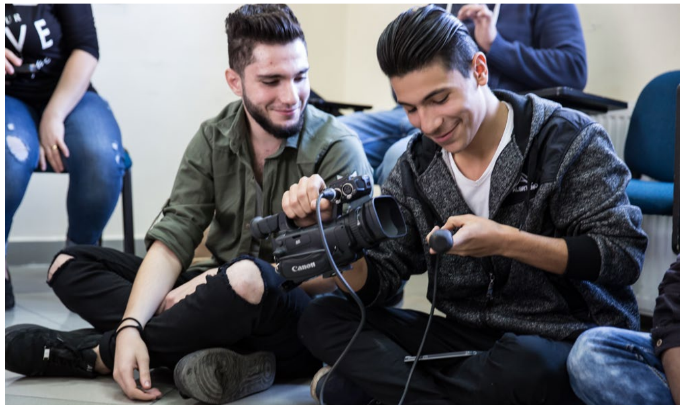
Out-of-school-time (OST) experiences can also be an important enabling factor for young social entrepreneurs. Young participants in a project of the International Organization for Migration are learning how to film, speak in front of a camera and use a microphone.