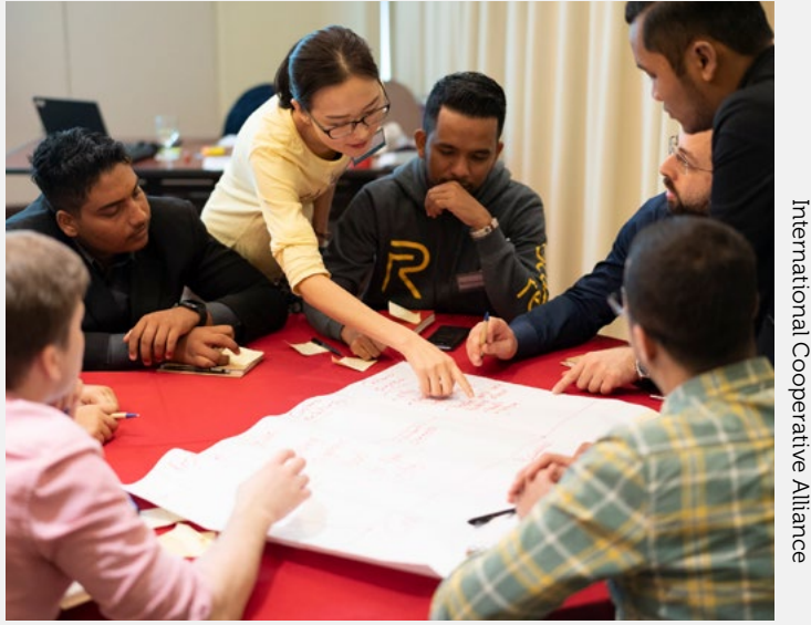
The Global Youth Forum — Cooperative Entrepreneurship 2020 (#GYF20) took place in Kuching, Malaysia, under the umbrella of the ICA-EU Partnership on international cooperative development (#coops4dev). Young participants from 50 countries attended a wide range of interactive training sessions to acquire the necessary professional skills to better understand the cooperative business model and its benefits. Among others, this event helped creating stronger links between the cooperative movement and other youth-led movements and organisations.

In the Global Study on Youth Cooperative Entrepreneurship, it is noted that individuals working