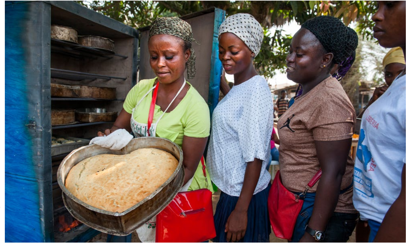
Young women bake bread in a mobile oven in a community bakery in their neighbourhood in Monrovia, Liberia.

communities (Purcell and Scheyvens, 2015). The success of social entrepreneurs is connected to their intimate knowledge of the local context, including social needs, norms and networks. Women represent an important asset in this context. The combination of income generation and social support makes social entrepreneurship an appealing form of empowerment for many women (Datta and Gailey, 2012; Haugh and Talwar, 2016). Interestingly, women's ventures are generally more socially driven than those of men and tend to exhibit better social performance outcomes (Lortie, Castrogiovanni and Cox, 2017).