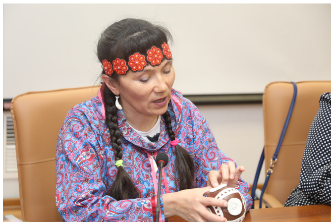
Seminar of the IPO «KMNSOYUZ», Dudinka, June 22–23, 2021

Indigenous businesses support and develop crafts and traditional life styles, and in so doing