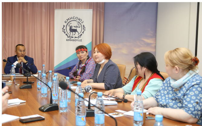
Seminar of the IPO «KMNSOYUZ», Dudinka, June 22–23, 2021

On the other hand, business can support languages not only financially, but also use languages in their direct activities, for example, using them on product packaging and in visual appearance of their products. Such measures increase prestige of languages and expand the scope of their use. Respect for Indigenous languages can be enshrined in corporate policies of industrial enterprises.