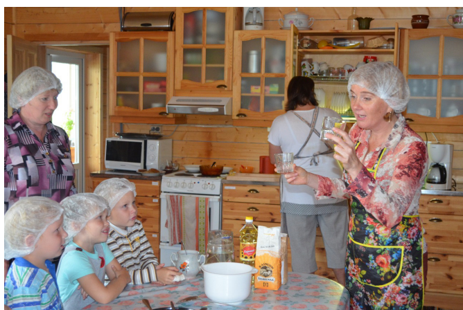
The «House of the Karelian language» in the village of Vedlozero

In parallel with decrease of Indigenous population and native speakers of Indigenous lan-