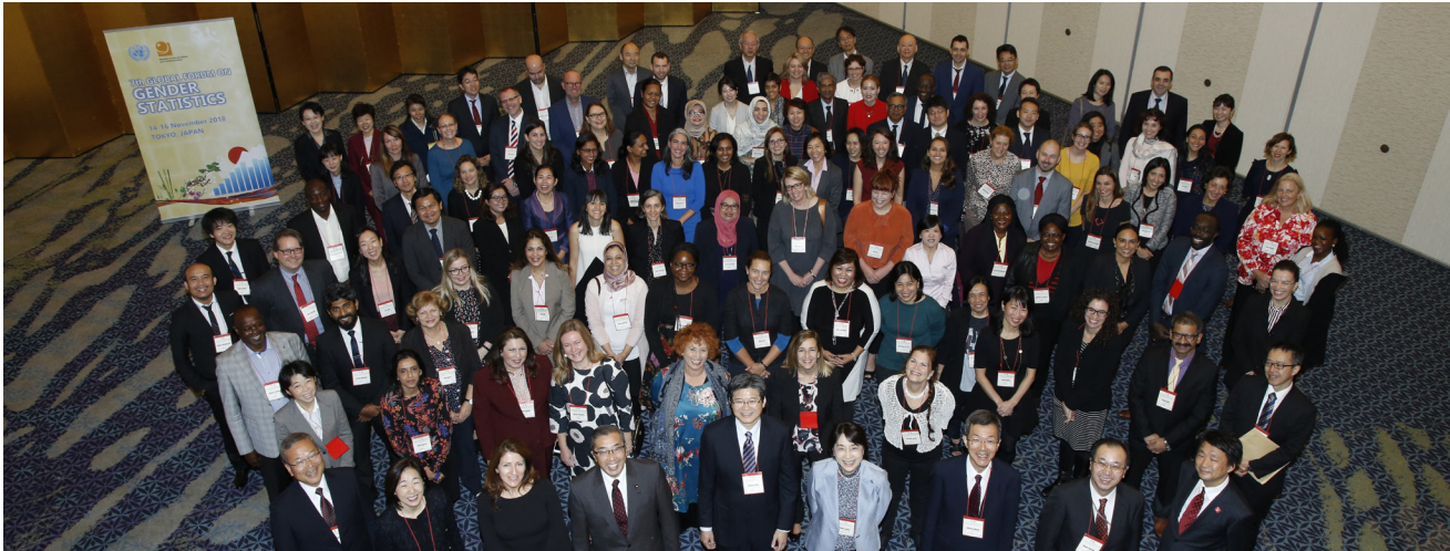
7th Global Forum on Gender Statistics, November 2018, Tokyo, Japan.