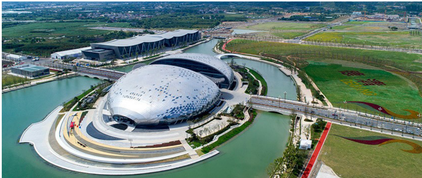
World Geospatial Information Congress, November 2018, Deqing, China.