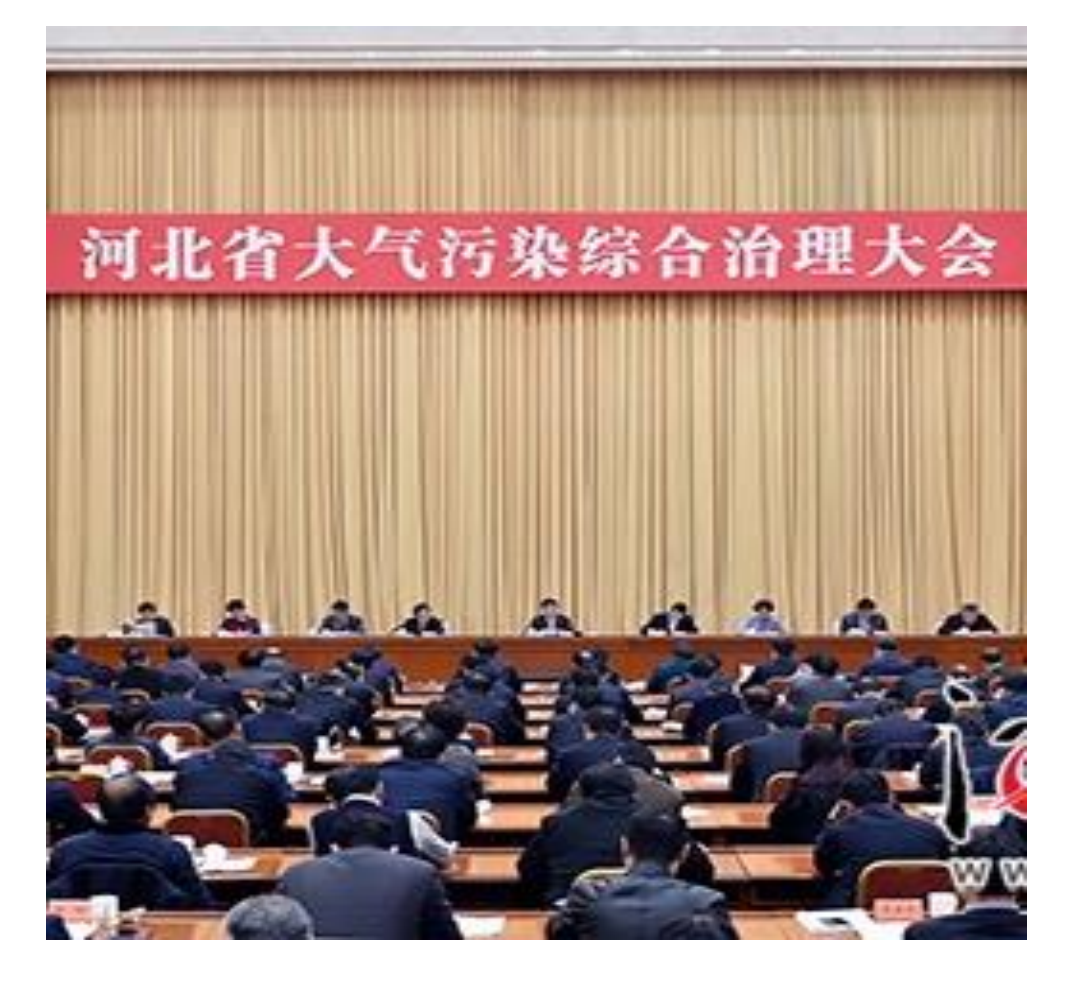
Air pollution campaign meeting, Hebei Province

Local officials held responsible for pollution reduction in their jurisdictions.