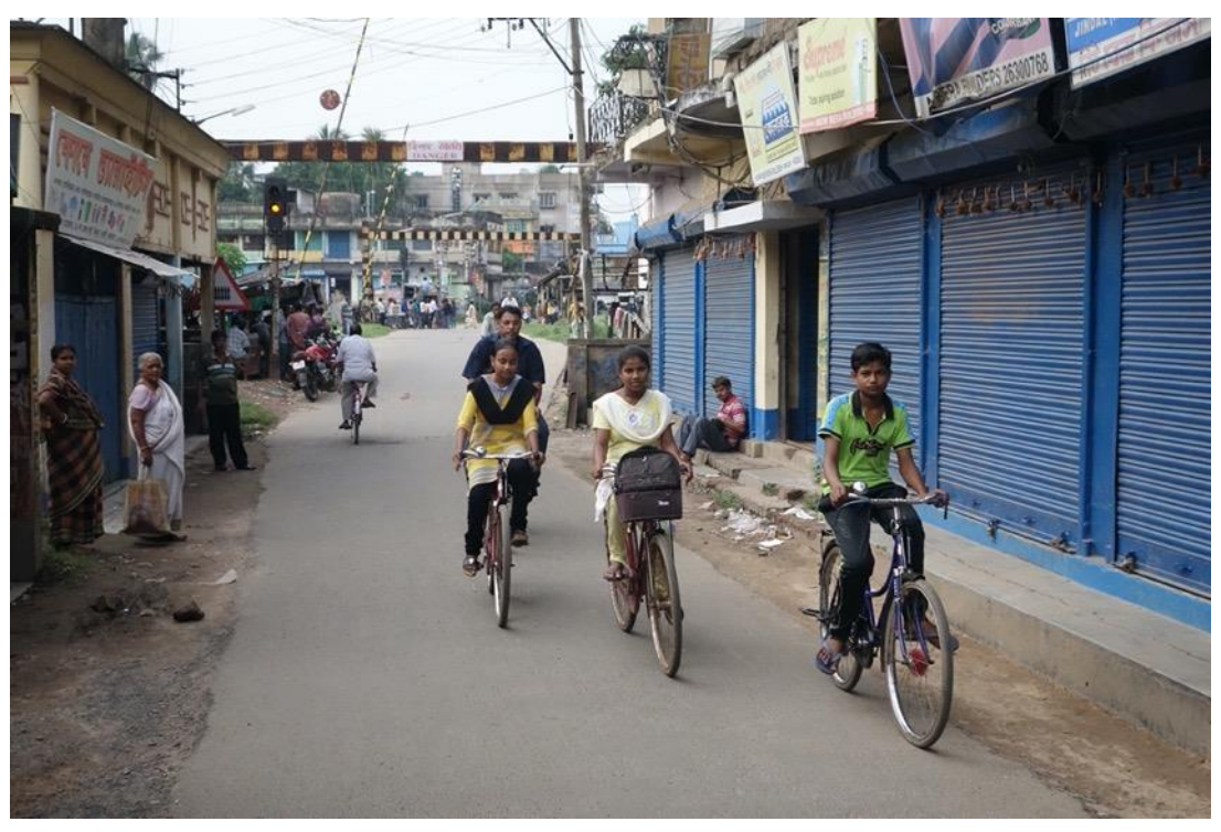
Singur, West Bengal