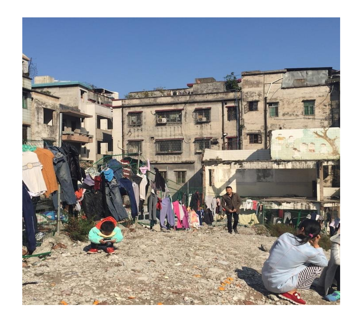
Xiancun, an urban village in Guangzhou