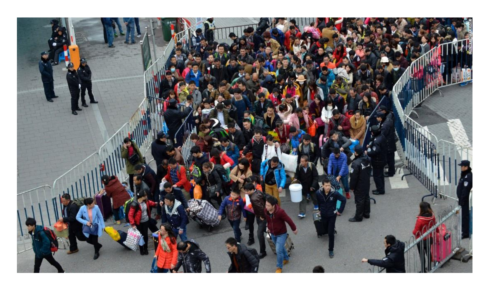
Guangzhou train station, China