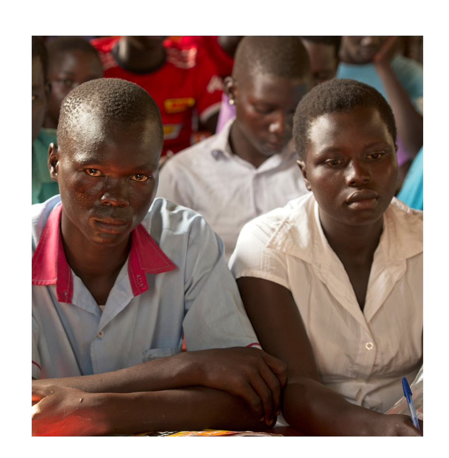
Poverty Eradication End poverty in all its forms