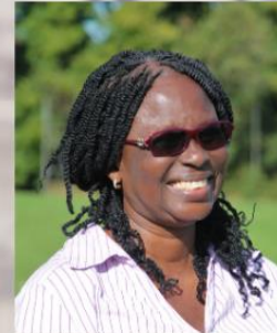
Gertrude Oforiwa Fefoame Member of the United Nations Committee on the Rights of Persons with Disabilities