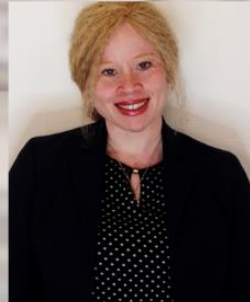
Ikponwosa Ero United Nations Independent Expert on the Enjoyment of Human Rights by Persons with Albinism