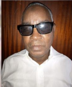
Danlami Basharu Chair United Nations Committee on the Rights of Persons with Disabilities