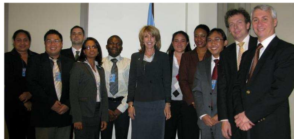
2009–2010 Fellows meet with the Under–Secretary–General, The Legal Counsel of the United Nations

The UN–Nippon Fellowship Programme is funded by The Nippon Foundation of Japan and implemented by the Division for Ocean Affairs and the Law of the Sea, with the assistance of the Training and Fellowships Section of the United Nations Division for Economic and Social Affairs.