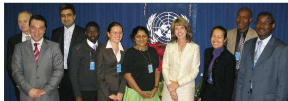
2008–2009 Fellows meet with the Under–Secretary–General, The Legal Counsel of the United Nations

The UN–Nippon Fellowship Programme is funded by The Nippon Foundation of Japan and implemented by the Division for Ocean Affairs and the Law of the Sea, with the assistance of the Training and Fellowships Section of the United Nations Division for Economic and Social Affairs.